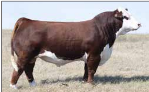
APH 4356 Colorado 15G

CE BW WW YW SCF MM UDDR TEAT 6.1 2.6 68 102 19.8 26 1.3 1.2