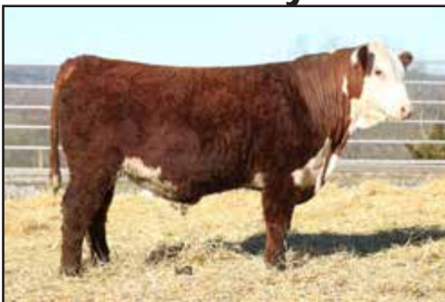
FTF Testimony 828F

CE BW WW YW SCF MM UDDR TEAT 2.7 2.9 74 119 21.4 29 1.3 1.1