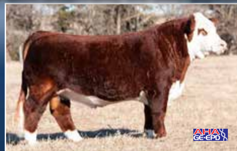
P43841015 Calved: 3/3/17 – Tattoo: LE 516E/RE LPH