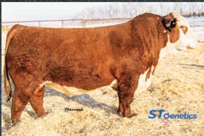
TH MASTERPLAN 183F (P43920493)

Sons of these popular A.I. sires will sell!