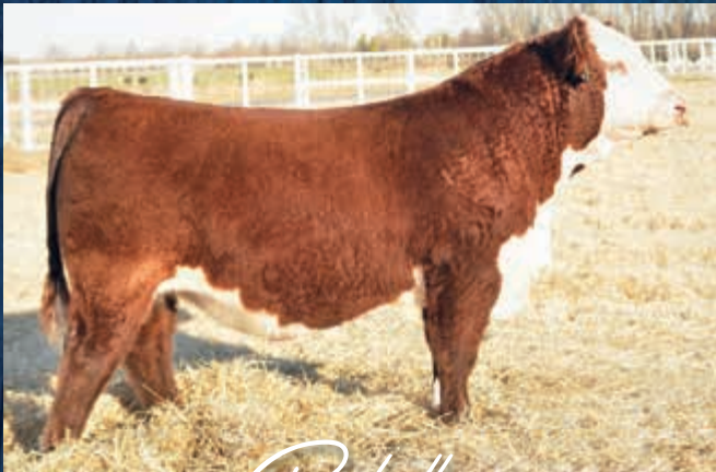
EXR Bankroll 1225 ET

P43899156 • 1/22/2018 • Polled S: BR Belle Air 6011 • MGS: LSW WCC About Time X06 GE-EPDs: CED -4.1 / BW +5.7 / WW +61 / YW +98 / MILK +35 / CW +87 / REA +.71 / MARB +.36 / $BMI +385 / $BII +478 / $CHB +171 Owned with Express Ranches & Topp Herefords