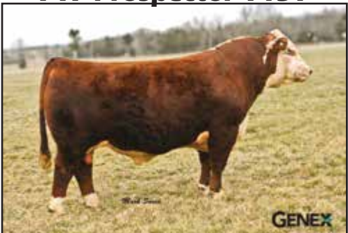
FTF Prospector 145Y

CE BW WW YW SCF MM UDDR TEAT 3.3 2.7 64 108 11.4 31 1.2 1.2