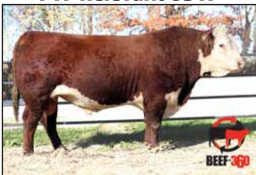
FTF Relevant 831F

CE BW WW YW SCF MM UDDR TEAT 14.4 -3.2 60 87 23.7 33 1.5 1.4