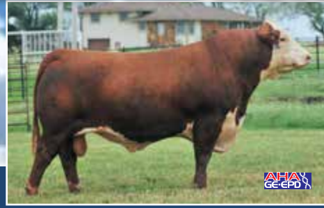
P43819777 Calved: 1/9/17 – Tattoo: BE 2E