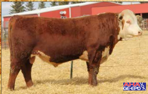
HH Advance 6226D ET {CHB}{DLF,HYF,IEF,MSUDF}