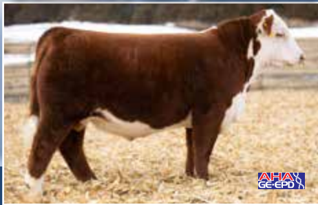
P44017084 Calved: 3/5/19 – Tattoo: BE 9253