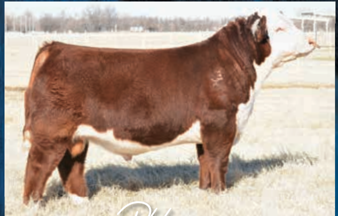
EXR Platinum 9200 ET

P44227674 • 2/10/2021 • Polled S: EXR Bankroll 8130 ET • MGS: NJW 735 M326 Trust 100W ET GE-EPDs: CED +1.3 / BW +3.4 / WW +62 / YW +114 / MILK +32 / CW +69 / REA +.63 / MARB +.12 / $BMI +370 / $BII +448 / $CHB +127 Owned with Express Ranches