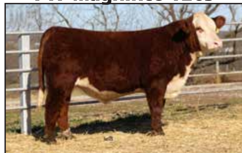
FTF Magnifico 120J

CE BW WW YW SCF MM UDDR TEAT 0.7 -0.2 63 99 21.5 36 1.4 1.4