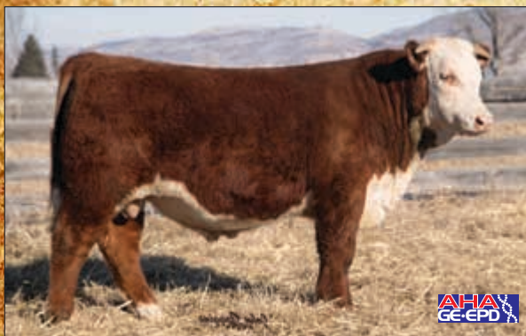
CL 1 Domino 136J 1ET {DLF,HYF,IEF,MSUDF}