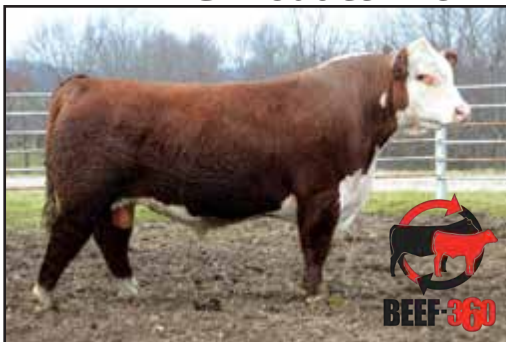
FTF Prime Product 226Z

CE BW WW YW SCF MM UDDR TEAT 2.3 1.3 63 97 18.8 46 1.2 1.1