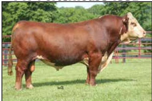
FTF Porterhouse 455B

CE BW WW YW SCF MM UDDR TEAT 3.0 2.0 66 112 19.9 32 1.2 1.2