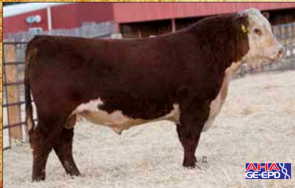
HH Advance 9293G {DLF,HYF,IEF,MSUDF,MDF}