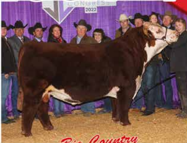
BR ER Big Country 007 ET Reg#: 44188539

SIRE: BR HUTTON 4030ET | DAM: BR BELLE 4082 ET National Grand Champion Hereford Bull 2022 Cattlemen's Congress - Oklahoma City, OK