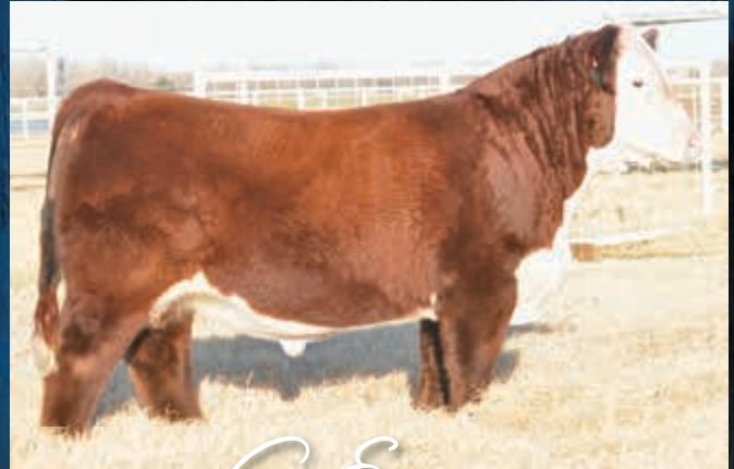
EXR Air Express 8135 ET

P43943448 • 3/5/2018 • Homozygous Polled S: Boyd Ft Knox 17Y XZ5 4040 • MGS: NJW 735 M326 Trust 100W ET GE-EPDs: CED +9.2 / BW +1.0 / WW +61 / YW +95 / MILK +27 CW +73 / REA +.49 / MARB +.22 / $BMI +449 / $BII +537 / $CHB +132 Owned with Fawcett's Elm Creek Ranch, Perez Cattle Co., Tennessee River Music, Inc. & McGuffee Polled Herefords