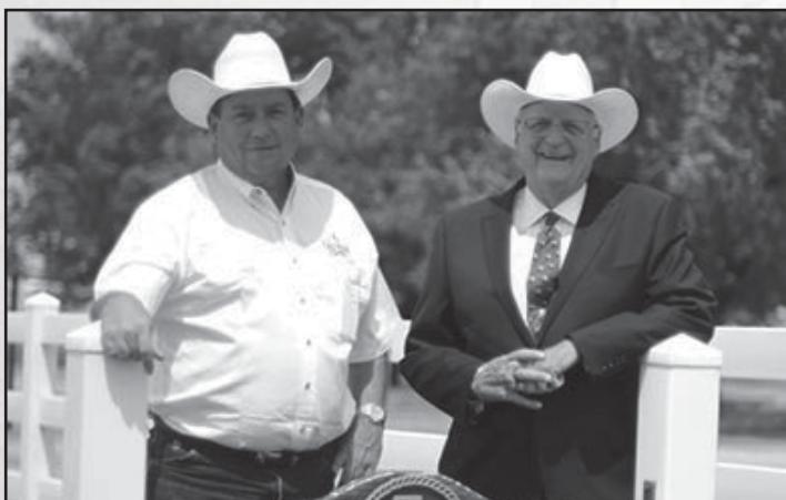
Congratulations Express Ranches!