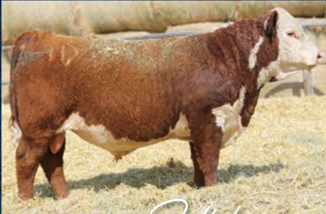
NJW 84B 4040 Fortified 238F

P43943448 • 3/5/2018 • Homozygous Polled S: Boyd Ft Knox 17Y XZ5 4040 • MGS: NJW 735 M326 Trust 100W ET GE-EPDs: CED +9.2 / BW +1.0 / WW +61 / YW +95 / MILK +27 CW +73 / REA +.49 / MARB +.22 / $BMI +449 / $BII +537 / $CHB +132 Owned with Fawcett's Elm Creek Ranch, Perez Cattle Co., Tennessee River Music, Inc. & McGuffee Polled Herefords