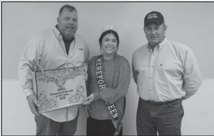
Congratulations Buford Ranches!