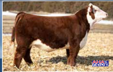
P44053547 Calved: 1/7/19 – Tattoo: BE 901