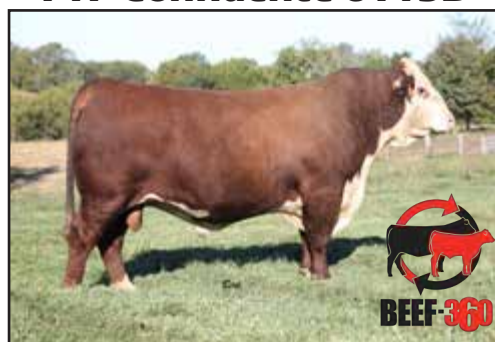
FTF Confidence 6113D

CE BW WW YW SCF MM UDDR TEAT 4.0 1.3 72 120 22.5 37 1.3 1.4