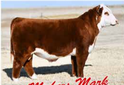
GREEN JCS Makers Mark 229G ET Reg#: P44042074

SIRE: LOEWEN GENESIS G16 ET | DAM: C CJC BELLE AIR LASS 8037 ET Owned with: Colyer Herefords & Iron Lake Ranch