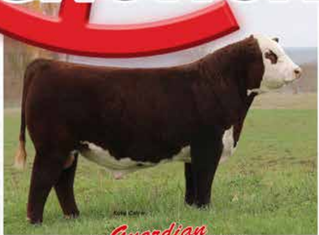
C GKB Guardian 1015 ET Reg#: P44257548