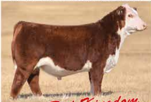
T/R GKB AC Red Kingdom J16 Reg#: P44282636