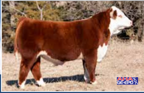
P43942688 Calved: 3/8/18 – Tattoo: BE 205F