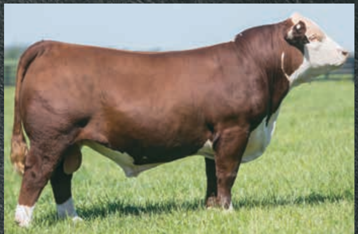
BOYD POWER SURGE 9024 (P44004782)