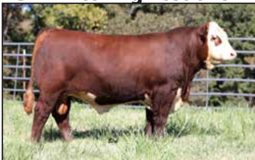
CMF Hitching Post 648H

CE BW WW YW SCF MM UDDR TEAT 6.2 2.7 82 129 13.3 26 1.4 1.3