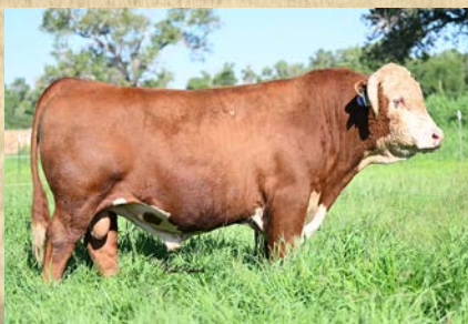
LW 7131 DOMINO 075H ET