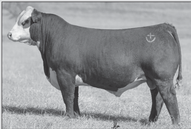
SHF Houston D287 H086