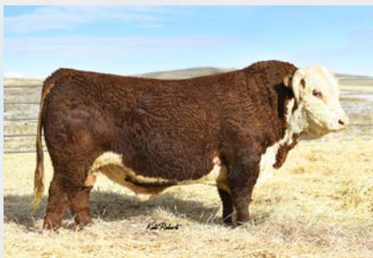
CL 1 DOMINO 9108G 1ET