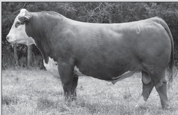
NJW 11B 6589 Authority 57G ET