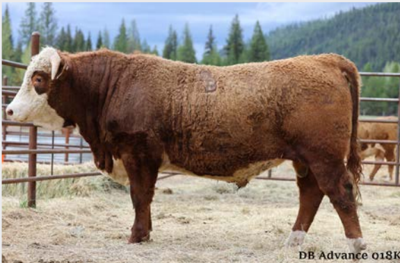
DB Advance 018K (44372850)