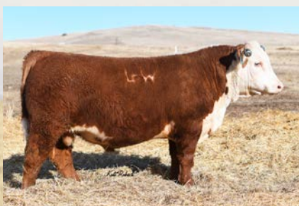
LW 6128 DOMINO 901G ET