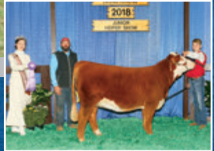
She Money - 43905686

COW P43905686 Calved: 9/26/17 • Tattoo: LE E42