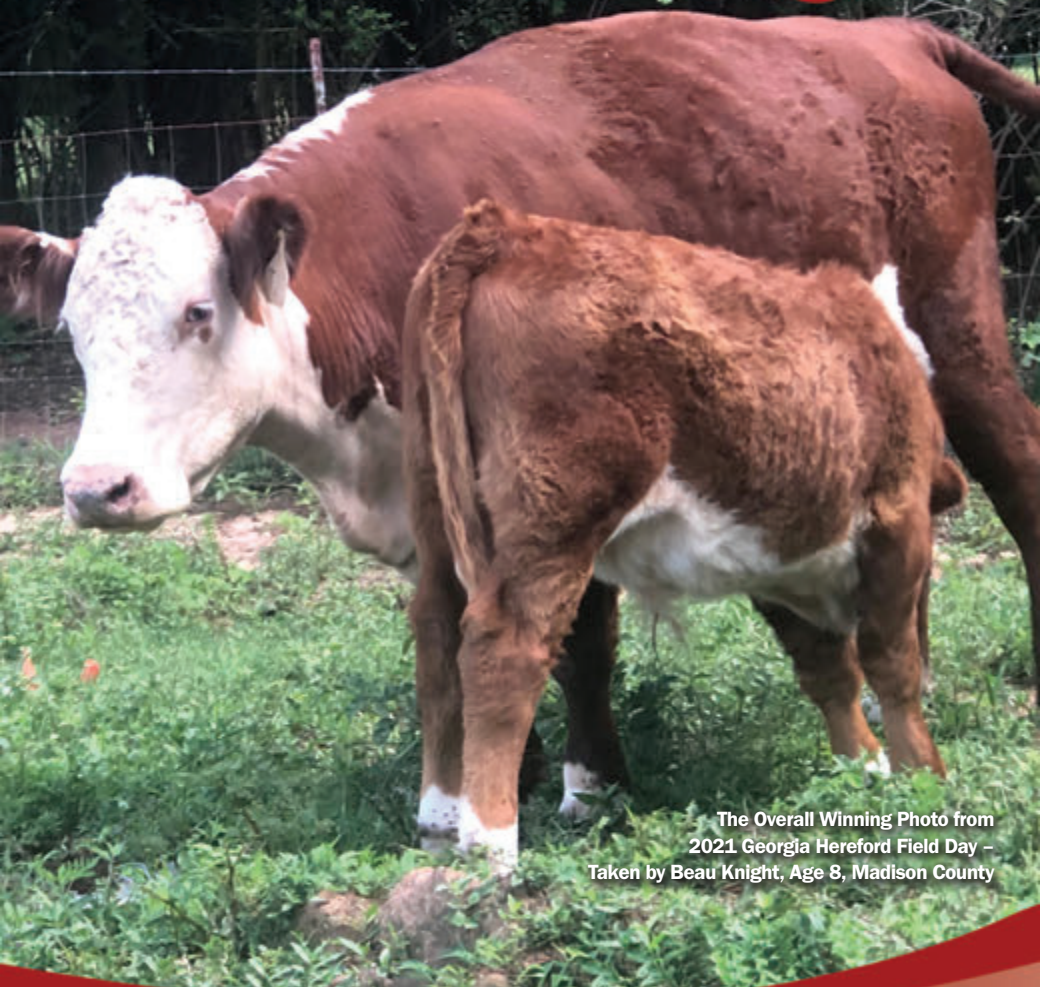
The Overall Winning Photo from 2021 Georgia Hereford Field Day