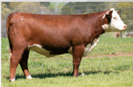
INNISFAIL T723 B413 1904 ET