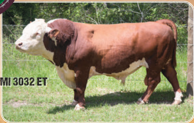
TRM 4263 HEMI 3032 ET