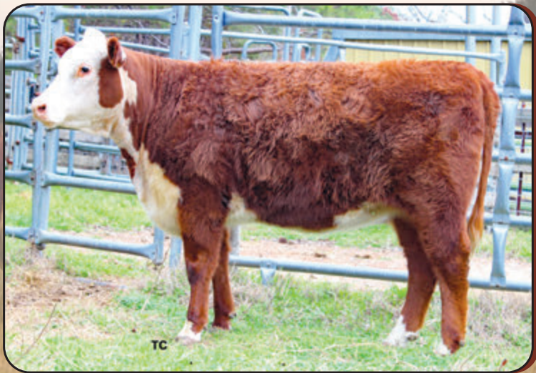
CCH 2026 Charlotte 46X C01 (43630890)