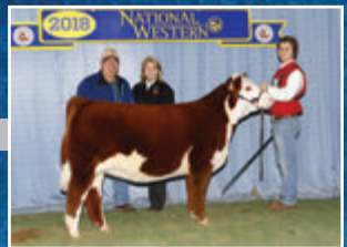
Mocha - 43824018

COW P43824018 Calved: 2/13/17 • Tattoo: LE 714