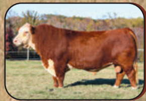
THM 100W Reliable 3018 ET (43362070)