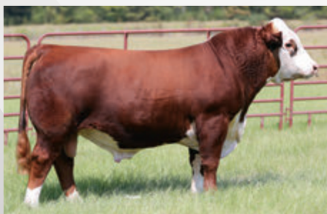
RMB PRIMETIME 341 F