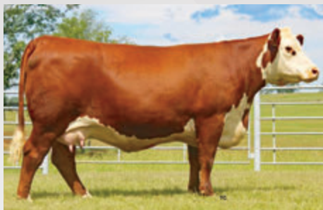
RMB 4020 SOUTHERN BELLE 049E