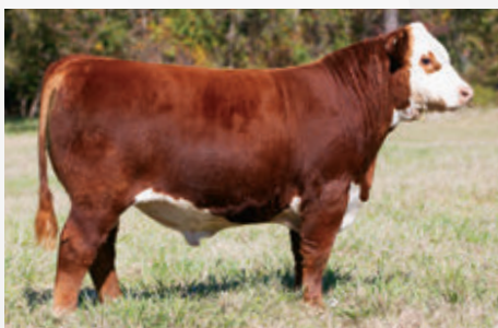
INNISFAIL ENERGY 4021 1837 ET