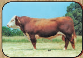
PW Victor Boomer P606 (24020737)