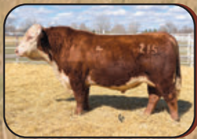
CL I Domino 215Z (43258007)