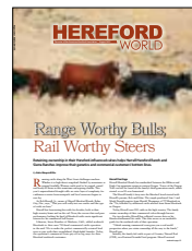
First place Newspaper cover

The Livestock Publications Council (LPC) recognized Hereford World , Hereford Publications Inc. (HPI) for excellence in several publication categories. The American Hereford Association (AHA) is a longtime LPC supporter. The LPC was founded nearly 50 years ago to serve and advance the livestock publishing industry.