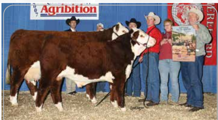
REMITALL MARVEL 296N – DAM OF LOT 11