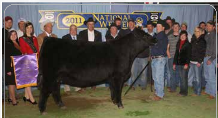
MALSONS SAVANNAH 27W – GRANDAM OF LOT 79