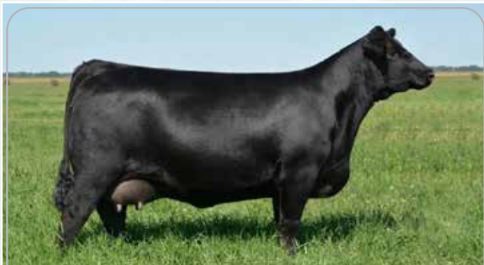
BAR-E-ERICA 74A – DAM OF LOT 65