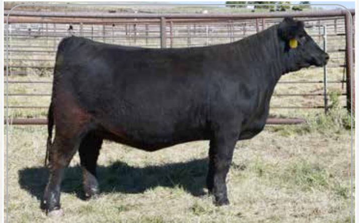
LOT 86 – WSF VALLEY LADY H183