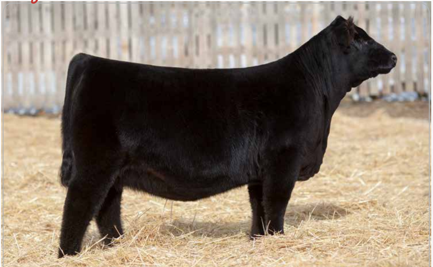
LOT 65 – FLUSH OF BLAIRWEST ERICA 5H