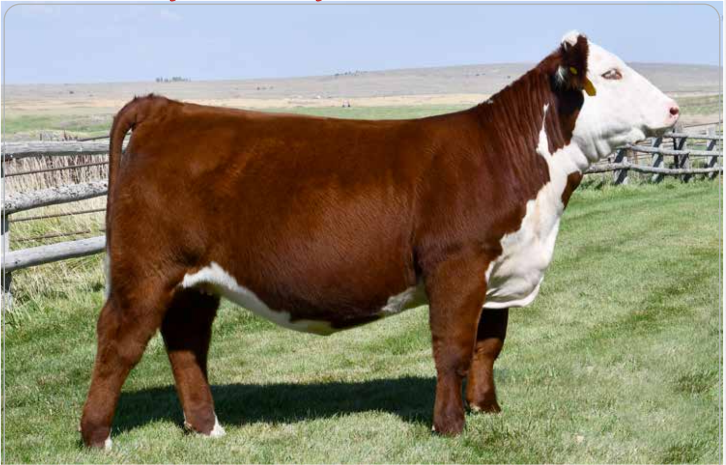
LOT 41 – JW WSF PRECIOUS LADY H421 ET