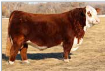
NJW 133A 6589 MANIFEST 87G ET — SIRE OF LOT 3C EMBRYOS