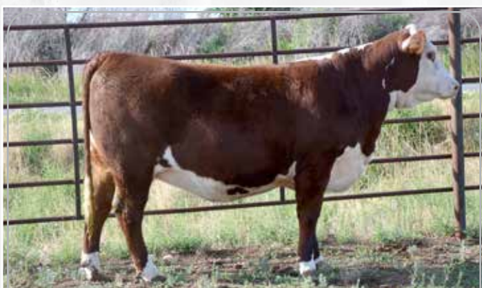
LOT 25 – 4TL LADY WARRIOR H14 ET