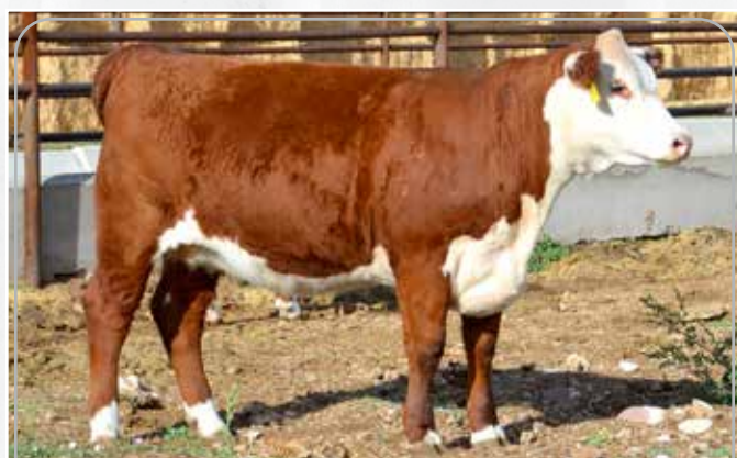
LOT 26 – WSF MISS BETTY H19

H W4 PURE COUNTRY 0109 {SOD}{DLF,HYF,IEF} GV CMR 1L BETTY 0109 A177 ET 43394951 DJB 46B BETH 1L {DLF,HYF,IEF,MSUDF}