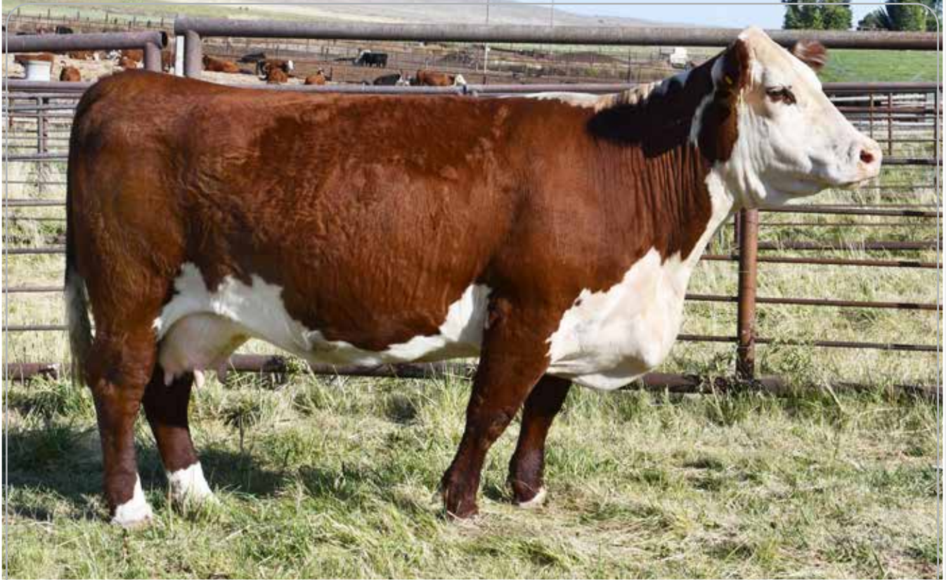
LOT 1 – WSF LADY SECURITY C42 ET