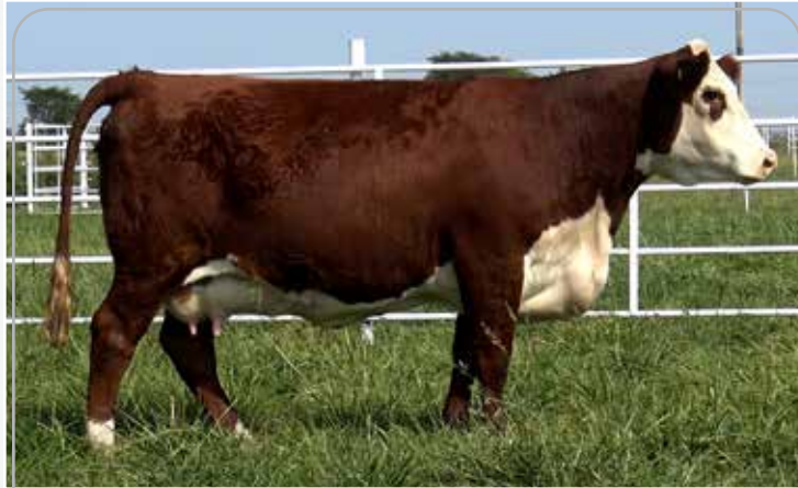
LOT 22 – MPH Z10 ZOE C46