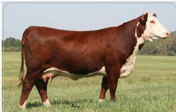
LOT 17 – RHF 200Z LADY IN RED 5087C

★ Should calve by sale day to PWF Last Chance P124 ET.