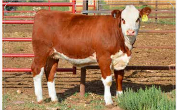
LOT 44 – 4TL BETH'S WARRIOR H111

★ This Warrior daughter has the pedigree and numbers to produce herd bulls and functional females! Her beautiful, dark red color and goggled eyes just adds to her value. She ranks in the top 10% for all the profit indexes. This one will make a terrific cow with lots of maternal value!