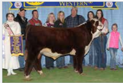
WSF TREND SETTER C35 ET