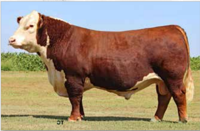
K CARTEL 708 ET