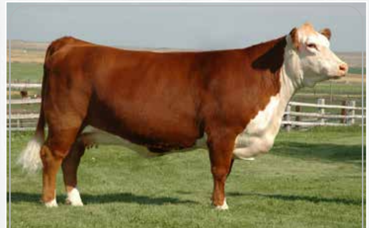
HERITAGE COW MADE 9004 ET – DAM OF LOT 38