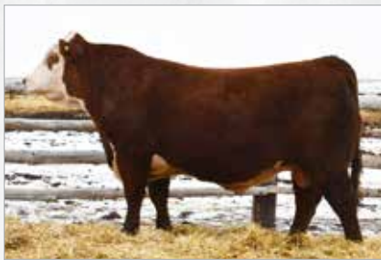
WSF WARRIOR FUSION F51