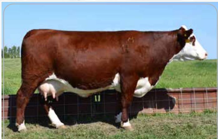
MOHICAN LADY 415S ET – DAM OF LOT 48