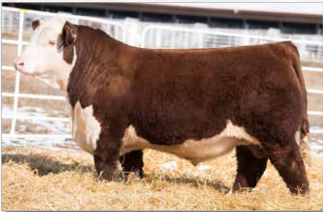
TH 13Y 358C BOTTOM LINE 206E