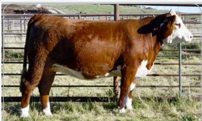
LOT 24 – WSF SOUTHERN BELL H8