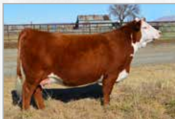
BF HARFST 322 AMAYA 8105 ET — DAM OF LOT 3A EMBRYOS