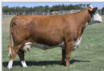
TH 372C 456B GEMINI 51E — DAM OF LOT 3D EMBRYOS