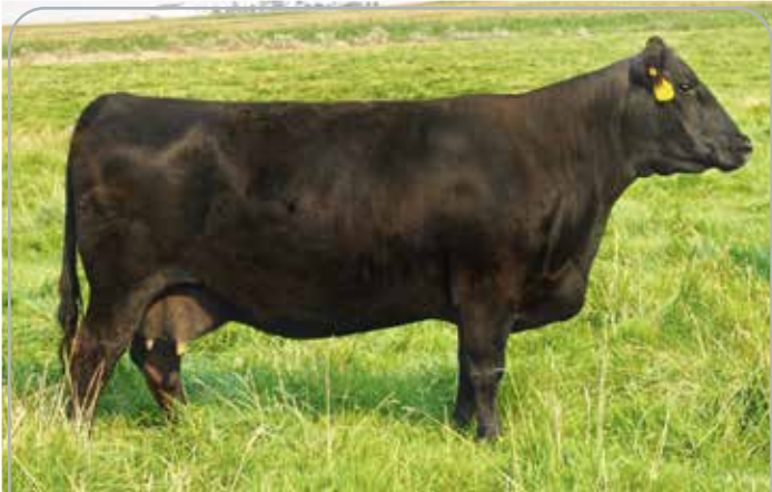
WSF LADY TRAVELER 624 – DAM OF LOTS 71, 77 AND 81