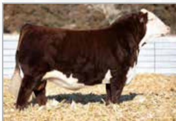
HAROLDSON'S UNITED 33D 36G — SIRE OF LOT 3A EMBRYOS

EMBRYO TERMS: Guaranteeing one pregnancy per mating. Buyer is responsible for shipping costs.