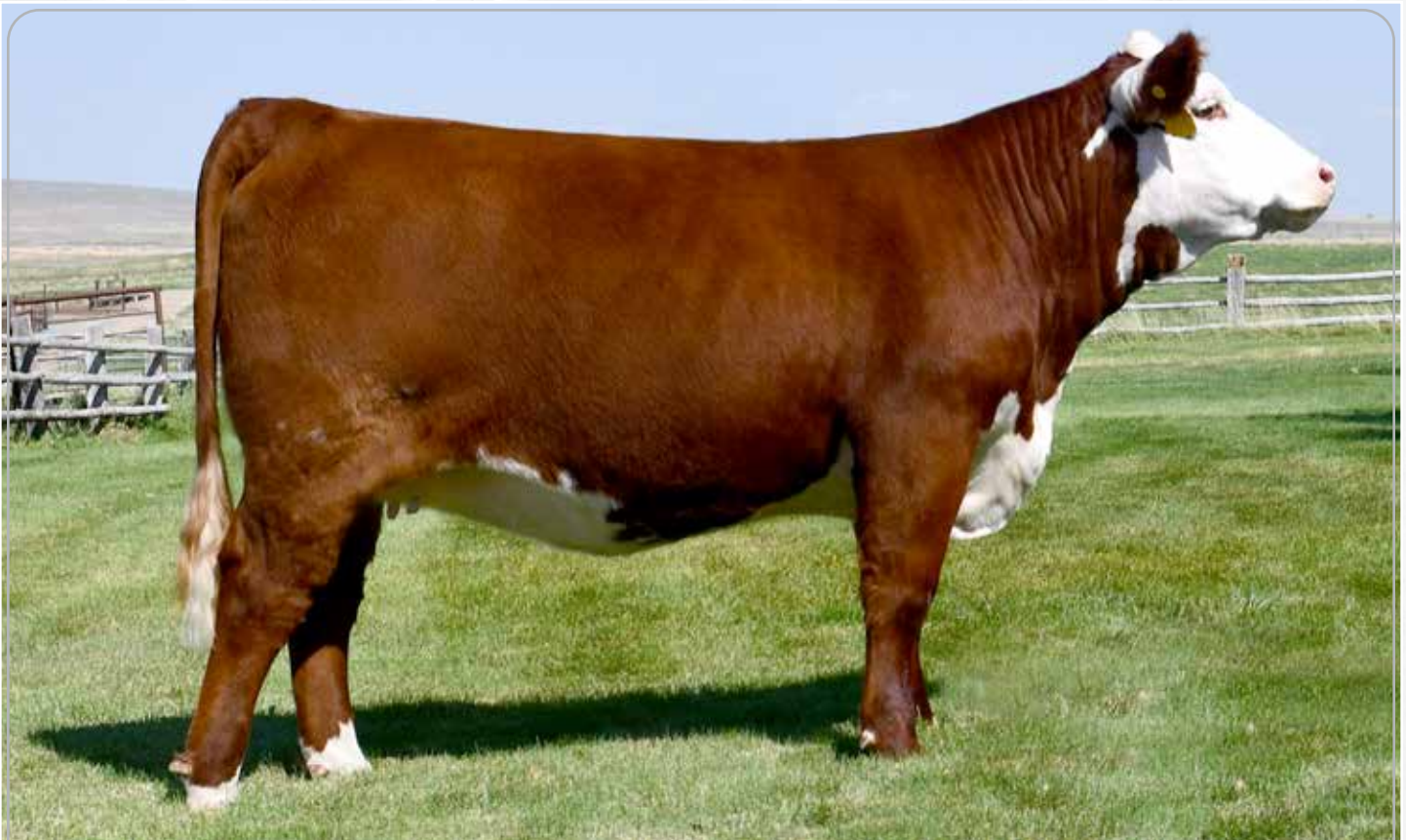
LOT 23 – WSF D320 MIRA H47 ET