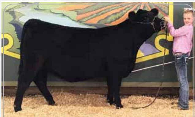
WSF LADY SAVANNAH E155 ET – DAM OF LOT 79