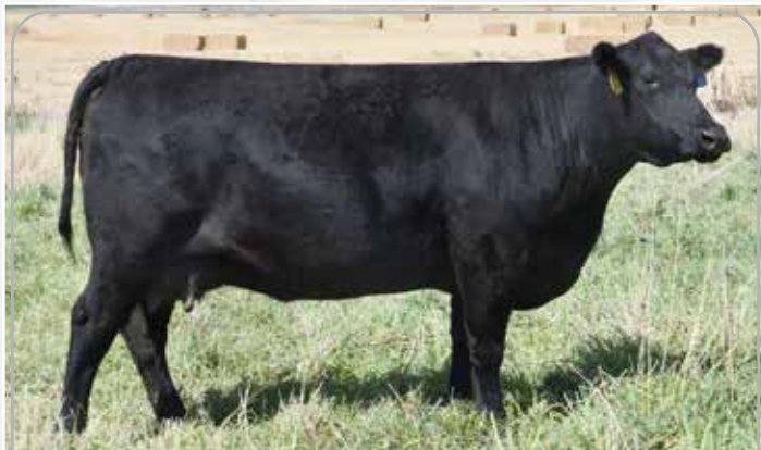
LOT 67 – RB MISS UPWARD 530