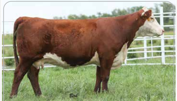
LOT 5 – MPH 122L VICTRA NICKI C6 ET