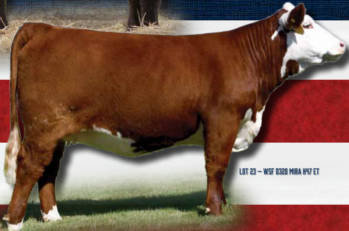
LOT 23 - WSF 0320 MIRA H47 ET