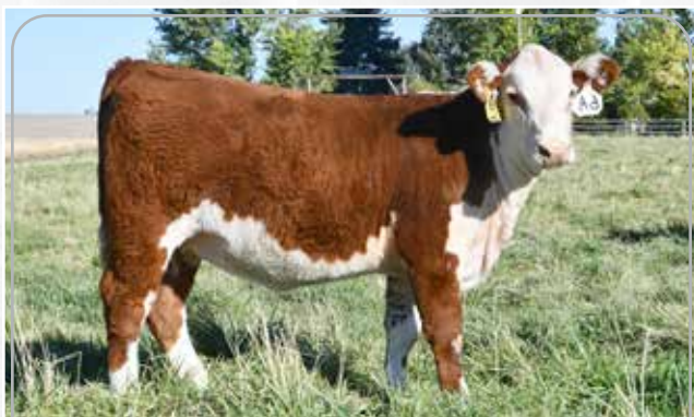
LOT 6A – WSF SOPHISTICATED LADY J166