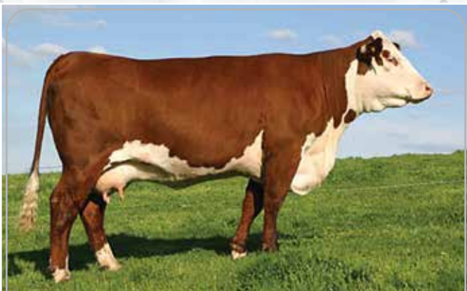
SB 122L DOTTIE 109N ET – DAM OF LOT 1

★ Bred AI April 24, 2021 to PWF Last Chance, then pasture exposed from May 5 to Aug. 2, 2021 to Mohican 4013 14G.