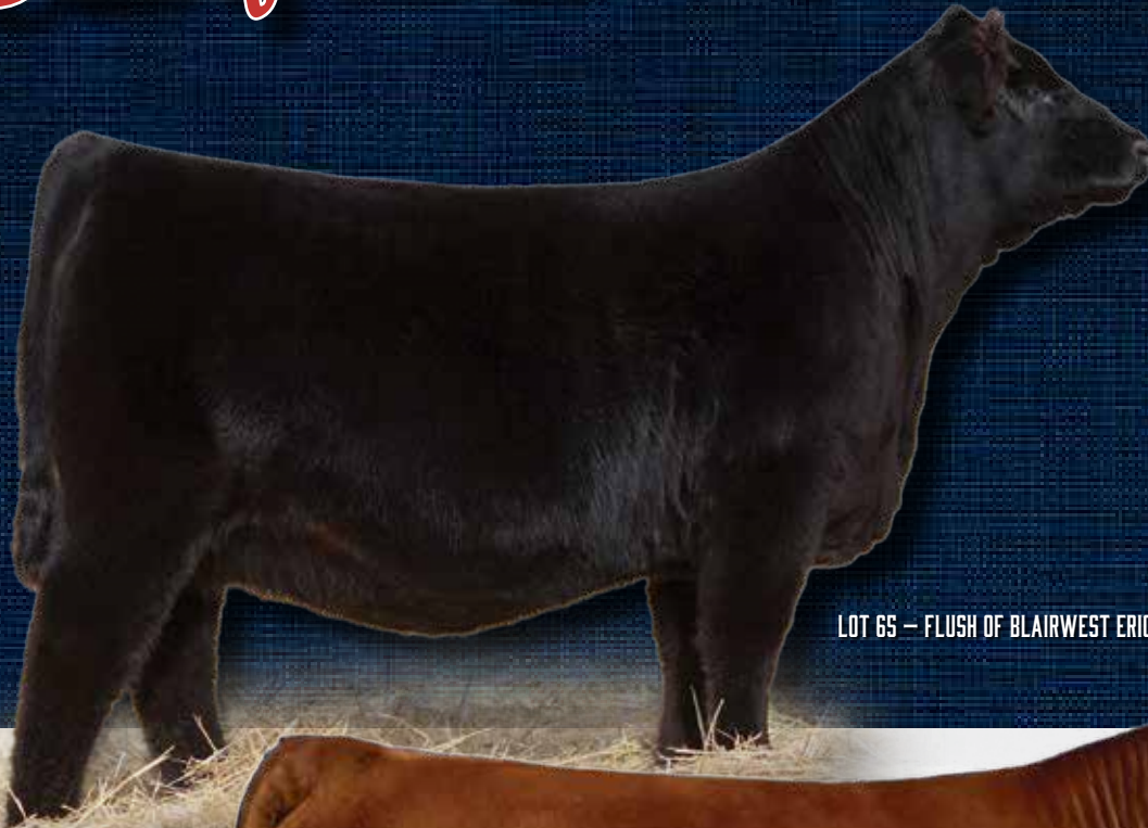
LOT 65 - FLUSH OF BLAIRWEST ERICA SH