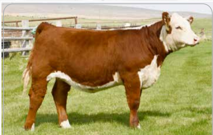
LOT 49 – WSF E36 MADEMOISELLE J123