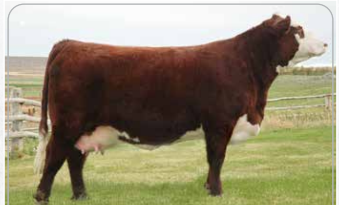
WSF HEREFORD LADY A114 ET – DAM OF LOTS 4 AND 20