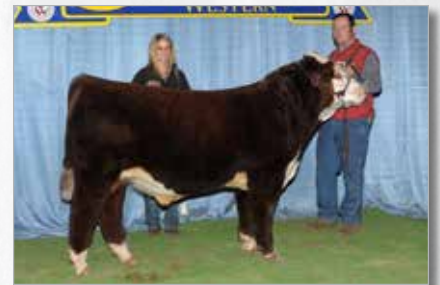
WSF UNLEASHED C40 ET