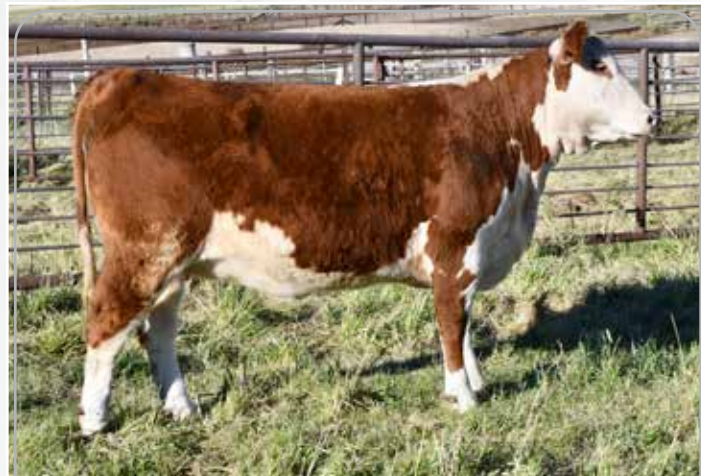
LOT 33 – WSF BRANDI H190