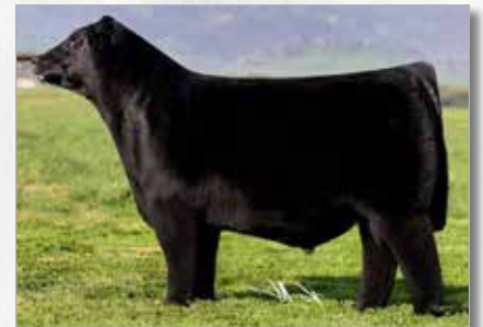
COLBURN PRIMO 5153