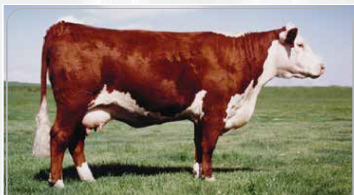
REMITALL CATALINA 24H – GRANDAM OF LOT 12