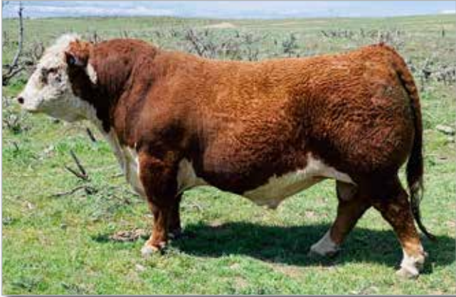
NLS 606 HOMEGROWN 80D ET