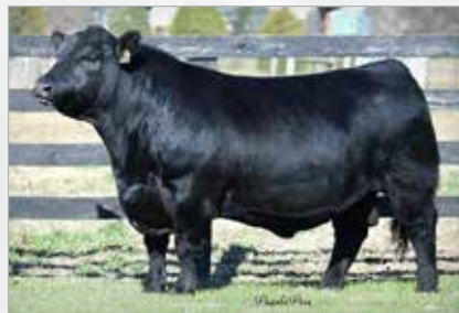
SAV AMERICA 8018