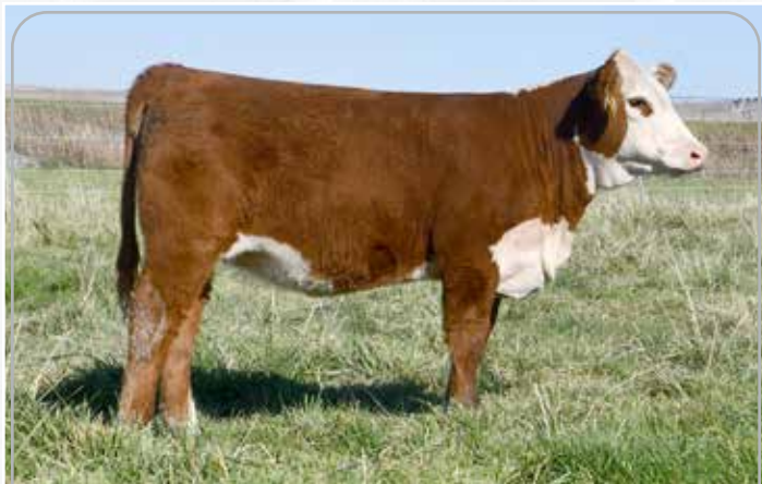
LOT 47 – WSF MIRA'S LADY J46