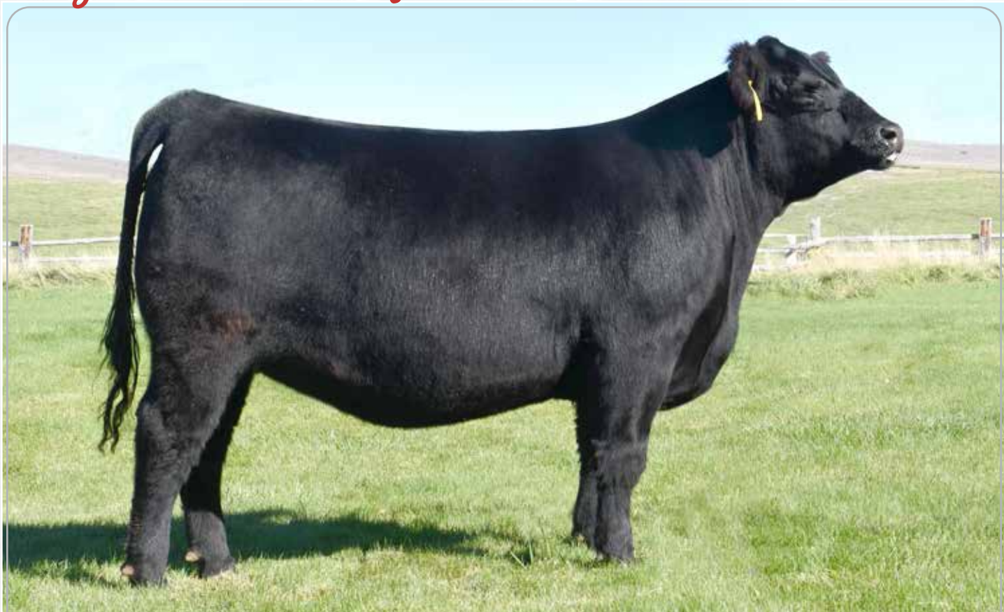
LOT 79 – WSF LADY SAVANNAH H182