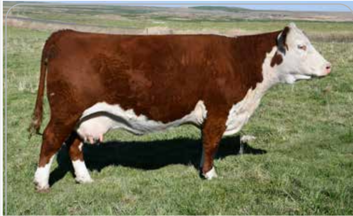
LOT 9 – WSF VICTORIA LADY D112 ET