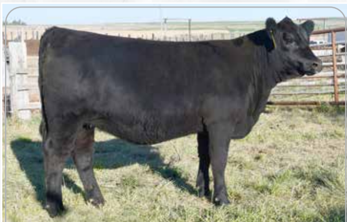
LOT 66A – WSF LADY SAVANNAH J91