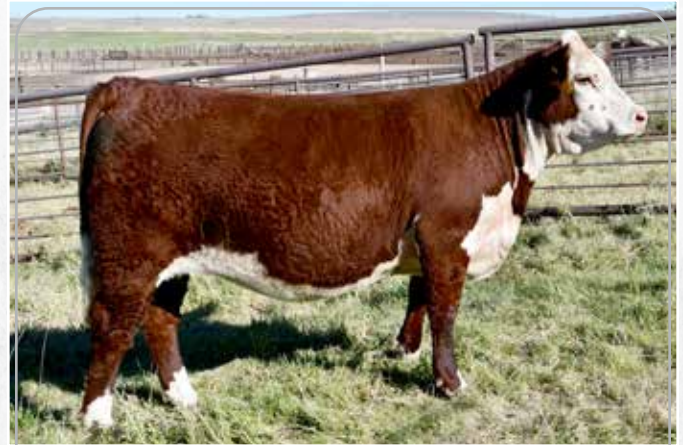
LOT 28 – WSF PRECIOUS LADY H54