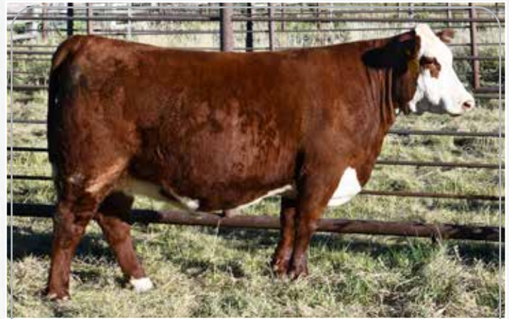
LOT 29 – WSF LADY FUSION H55