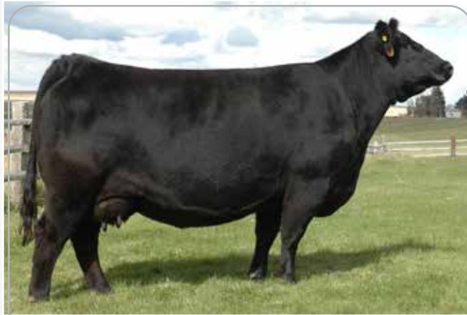
WSF MADAME WORTH 1088 – DAM OF LOT 88