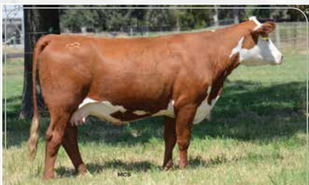
LOT 7 – SR 436X CONESSA 5044 ET