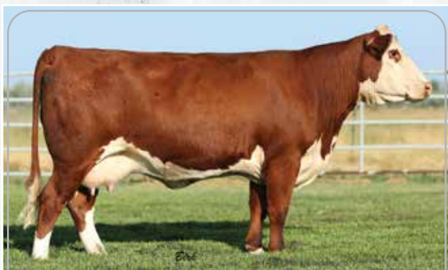
LOT 8 – PWF CTE MISS CHANCE P403