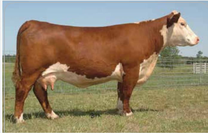
HAROLDSON'S WLC MONA ET 327N – DAM OF LOT 13