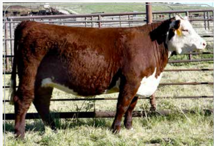
LOT 34 – WSF D410 DREAMER H201 ET