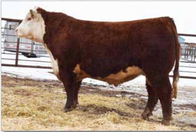
WSF TIME TESTED F73