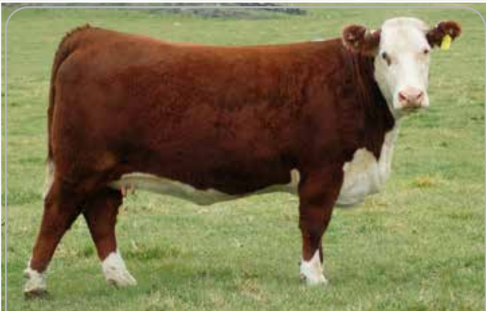
WSF MIRA'S LADY D320 – DAM OF LOT 23