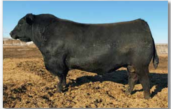
MALSONS CONFIDENCE SC