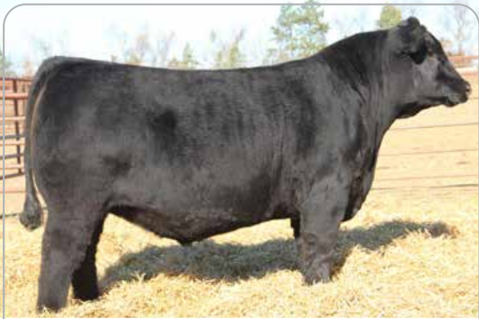
SAV PATERNAL 4484 – SIRE OF LOTS 71 AND 73