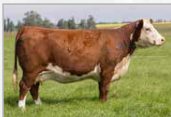
HARVIE MS FIREFLY 55C — DAM OF LOT 3B EMBRYOS