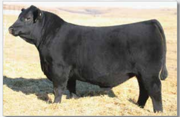
SAV WIDE CUT 6081