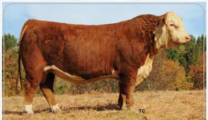
INNISFAIL WHR X651/723 4013 ET – SIRE OF LOT 23