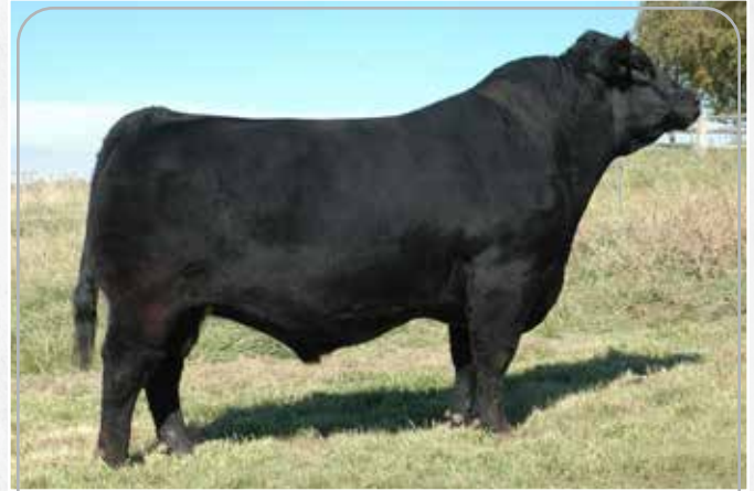
D5 – SIRE OF LOTS 79, 84, 89 AND 90