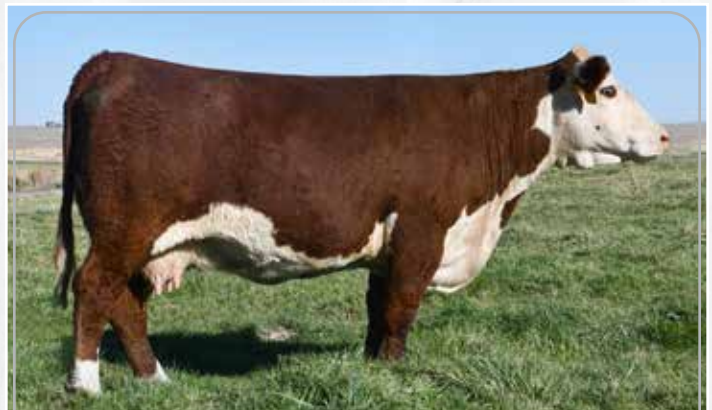
LOT 6 – WSF SOPHISTICATED LADY C38 ET