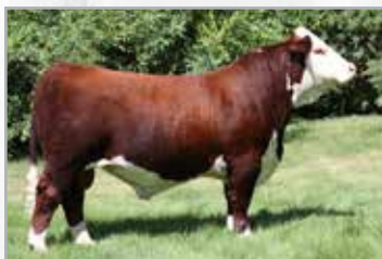
REMITALL-W WE THE NORTH ET 83G — SIRE OF LOT 3B EMBRYOS