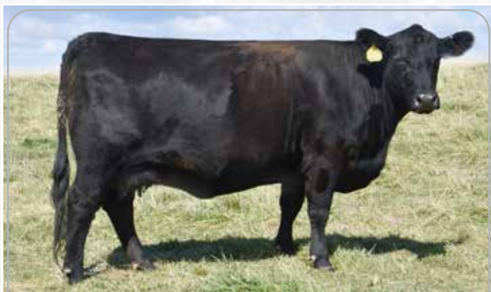
LOT 66 – GOHR SAVANNAH 5004