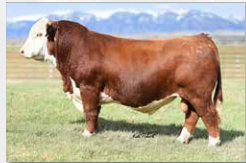
NJW LONG HAUL 36E