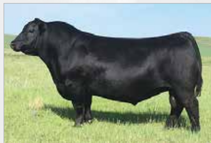
SAV PRESIDENT 6847