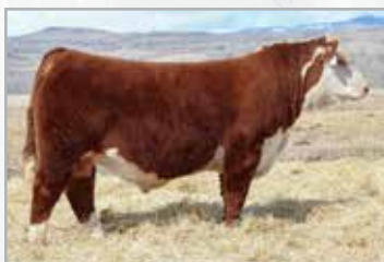
CHURCHILL SILVER 0288H ET — SIRE OF LOT 3D EMBRYOS