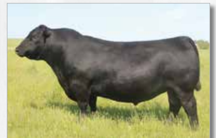
SAV RAINFALL 6846