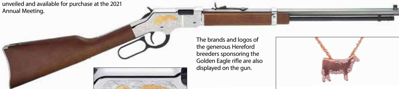
The brands and logos of the generous Hereford breeders sponsoring the Golden Eagle rifle are also displayed on the gun.