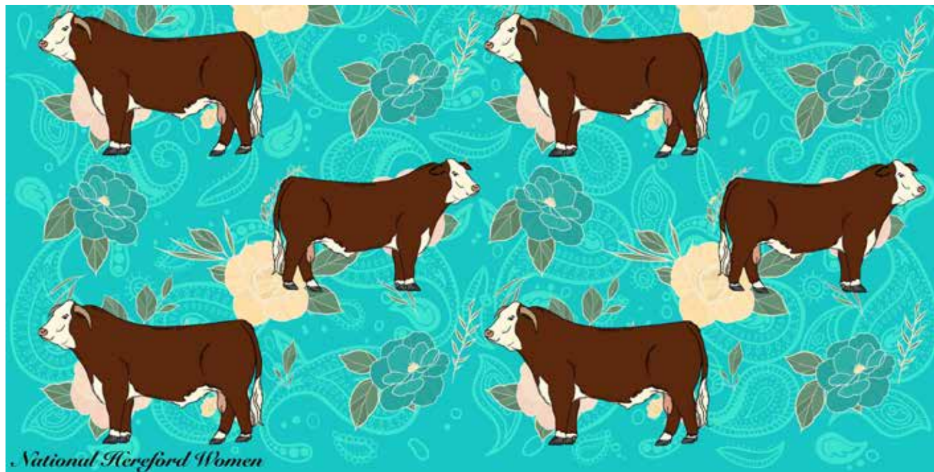
The newest NHW wild rag design will be officially unveiled and available for purchase at the 2021 Annual Meeting.

The second new fundraiser that launched in Kansas City, Mo., during JNHE, was the NHW Official Trading Cards. We thought this one would really