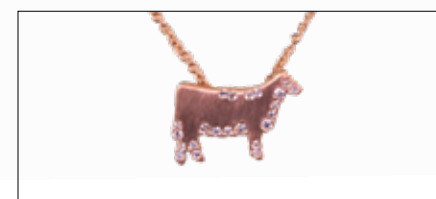
14-karat rose gold pendant

resonate with the junior members. For many of us, collecting and trading baseball cards was one small, but memorable, highlight of our youth. I know I still have a shoebox full of them that I just can't part with.