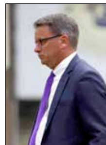
Judge Mark Core

See Page 107 for class placings and division photos. For complete results, visit Hereford.org . HW