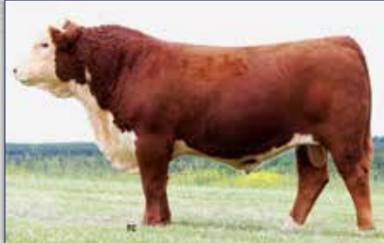
BEHM 100W CUDA 504C Reference Sire of Lot 12.