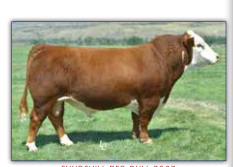
CHURCHILL RED BULL 200Z Sire of Lot 42.