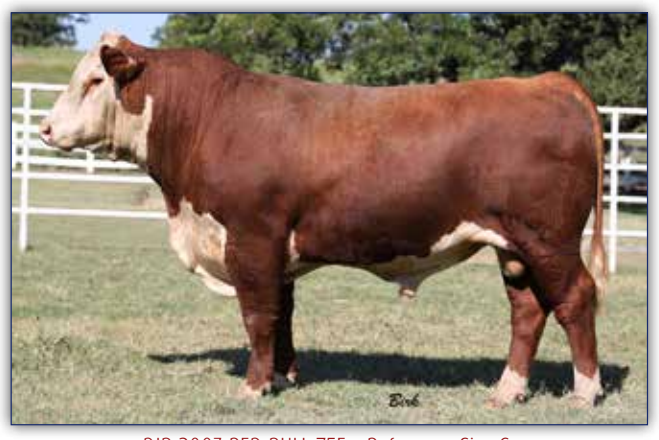
DIB 200Z RED BULL 75F - Reference Sire G.