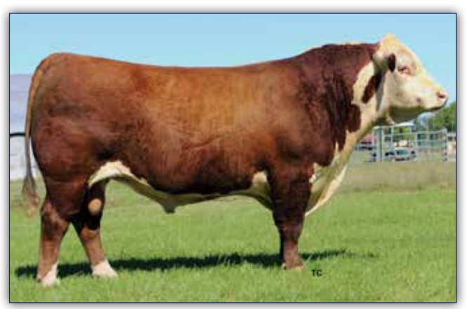
MOHICAN THM EXCEDE Z426 - Reference Sire D