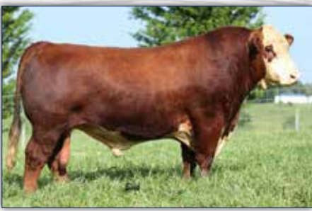
DIB BCB R117 SINATRA 14C ET -Sire of Lots 2 & 3.