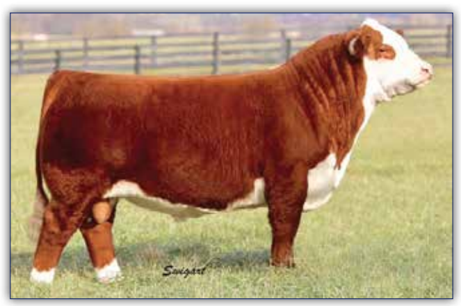
BOYD 31Z BLUEPRINT 6153 - Sire of Lot 26 Embryos.