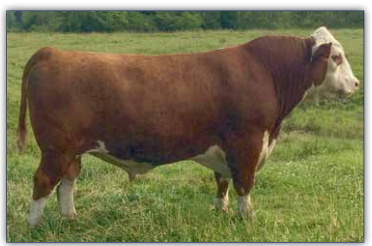
Sire of Lot 49.

Ranks in the top 1% for REA, CHB; top 2% for CW, MARB; top 10% for TEAT and top 20% for YW.