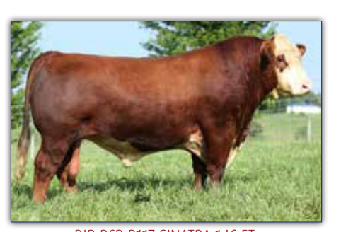
DJB BCB R117 SINATRA 14C ET Reference Sire of Lot 2.