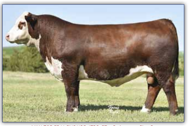
NJW 79Z Z311 ENDURE 173D ET - Reference Sire B