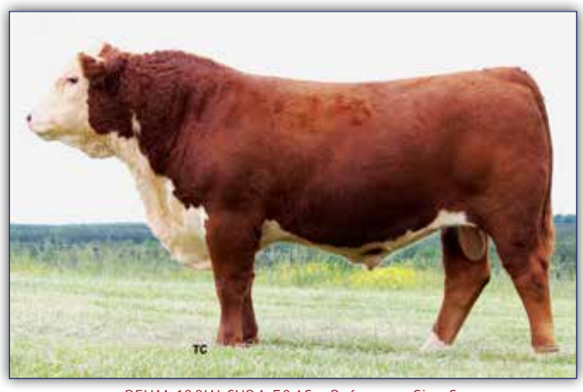
BEHM 100W CUDA 504C - Reference Sire C.