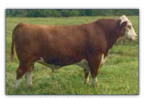
DJB X51 MOMENTUM 6C Sire of Lots 4 & 5.