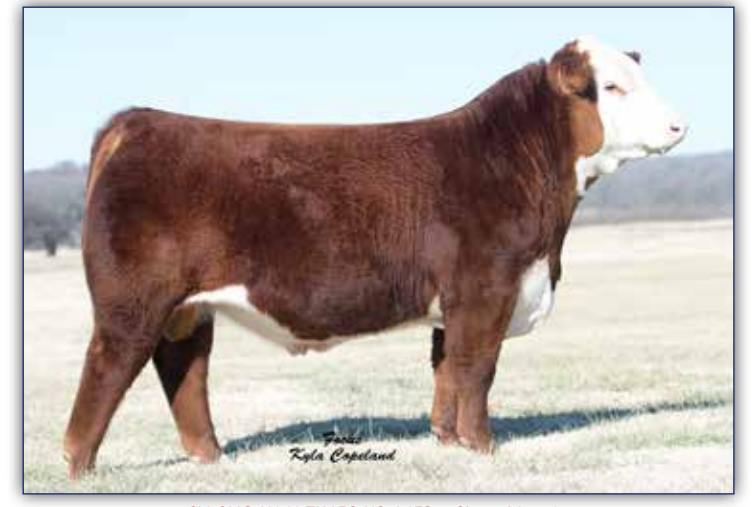
GV CMR X161 TIMES UP A152 - Sire of Lot 1.