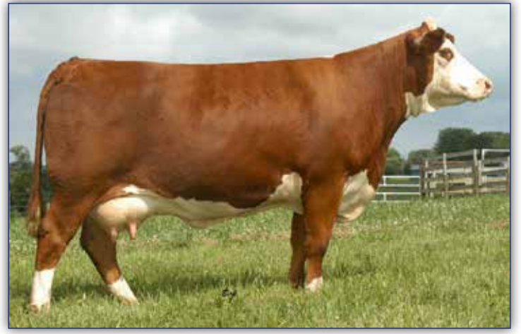
DJB 46B BETH 1L - Maternal Granddam of Lot 35