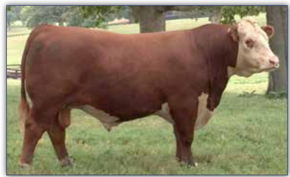
C ETF WILDCAT 4248 ET - Sire of Lot 17.