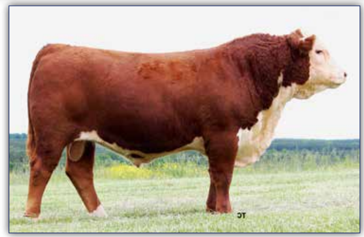
BEHM 100W CUDA 504C - Sire of Lot 15A.