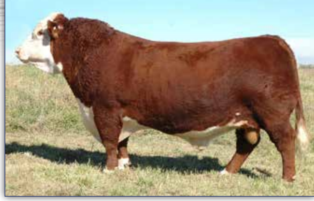
WSF HOME SCHOOLED B76 ET - Reference Sire E.