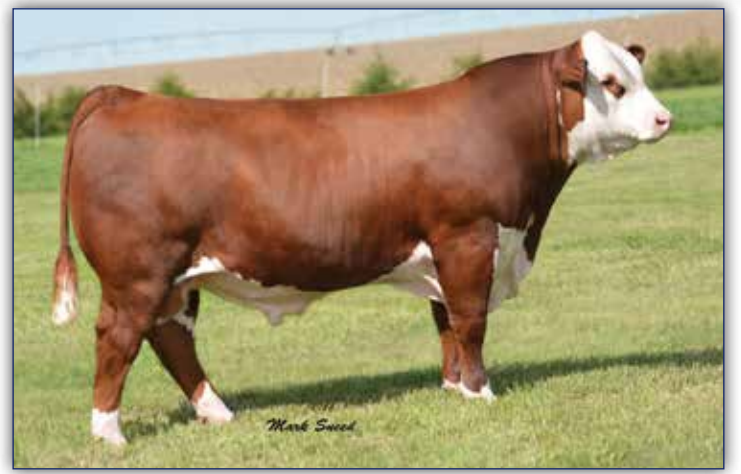
R LEADER 6964 - Sire of Lot 15.