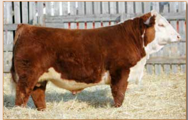
Haroldson's Apothic 521X 38B – Sire of Lot 11A