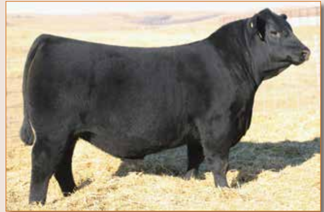
SAV Wide Cut 6081 - Sire of Lot 58A