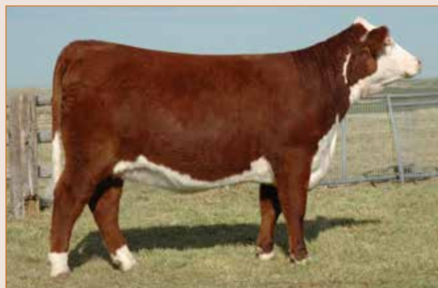
Lot 31 – WSF Lady Mona F143