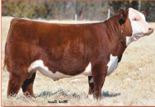
SULL TCC Mr Custom Made 340 ET – Sire of Embryo Lot 7C

SULL TCC MR CUSTOM MADE 340 ET (P43457417) WSF PROOFS LADY SUCCESS A31 ET (P43472307)