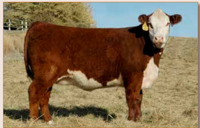
Lot 12 – WSF Megan F106