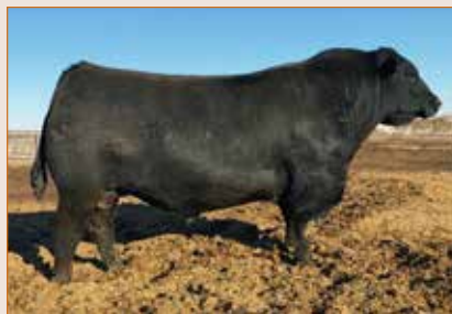
Malsons Confidence 5C