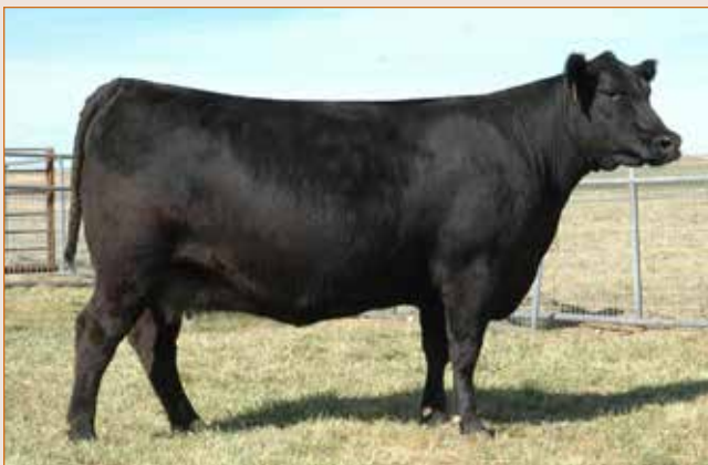
Lot 63 – UCC Miss Active Duty 690