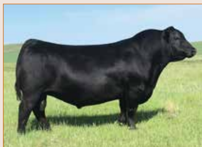
SAV President 6847