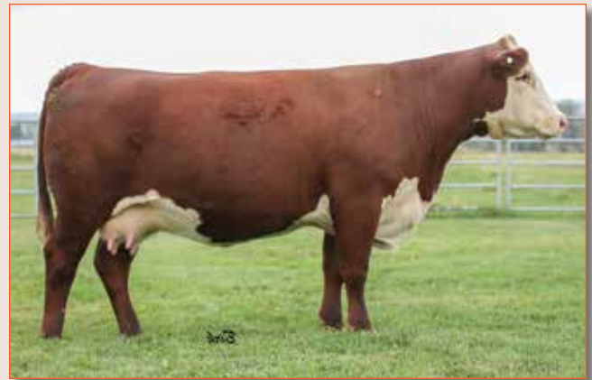
Lot 11 – Mohican Megan 410A ET