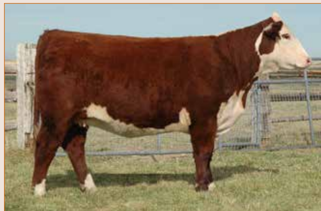
Lot 32 – WSF 687 Cherry Pie F69 ET