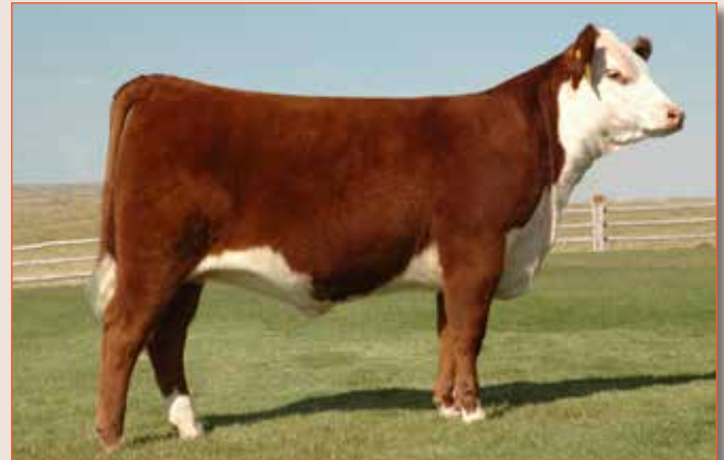
Lot 24 - WSF Lady Apothic F305