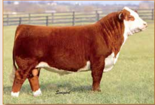
Boyd 31Z Blueprint 6153 – Sire of Embryo Lot 7D

BOYD 31Z BLUEPRINT 6153 (P43764491) WSF LADY SUCCESS 576 ET (P42715834)