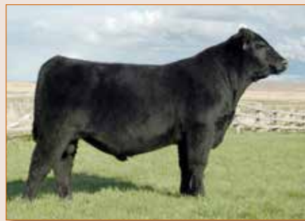
WSF Shockwave D5