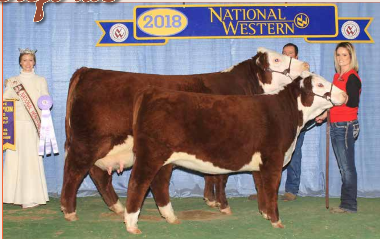
Lot 1 – WSF Marvelous Lady C17 ET