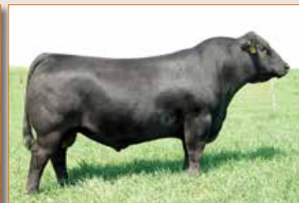
SAV Resource 1441