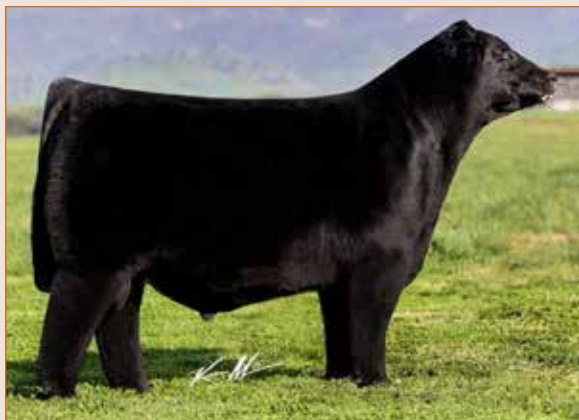
Colburn Primo 5153 – Sire of Lot 56A and Lot 63A