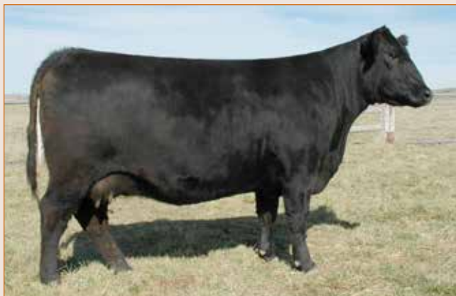
Lot 56 – WSF Lady Universal E82 ET