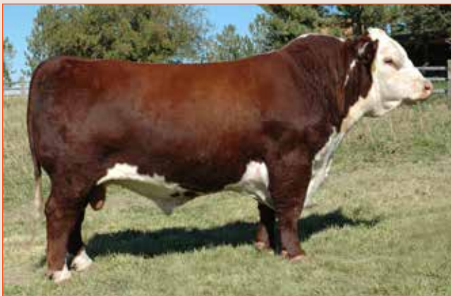
WSF 327N Josey Wales D58 ET – Maternal brother to Lot 27