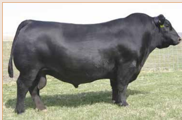
SAV Net Worth 4200 – Sire of Embryo Lot 54