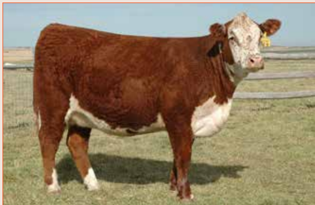
Lot 10 – WSF Plus I'm Pretty F63

★ Lot 9A is sired by the 2016 Denver National Champion Bull, LCC FBF Time Traveler 480. Her donor dam Mohican Plus 423A, is way cool! WSF Lady Time G48 is one to consider for the 200 show season. G48 is wide topped, long fronted with extra profile. This elite heifer calf is one of our personal favorites, take a look and decide. Retaining one future flush.