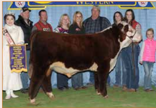
WSF Trend Setter C35 ET