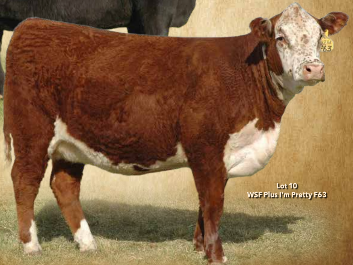
Lot 10 WSF Plus I'm Pretty F63