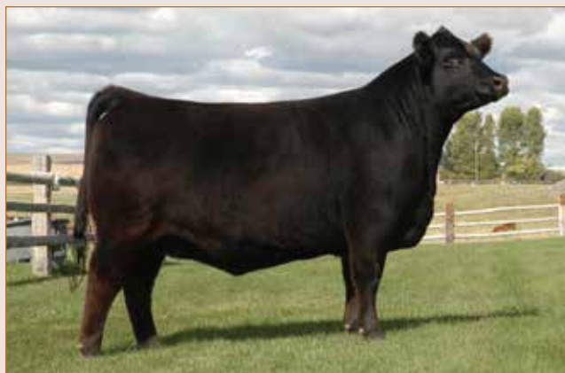
Lot 50B – WSF Lady Savannah E308