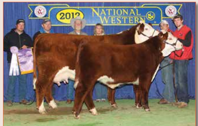
WSF Lady Catalina 8045 – Maternal sister to the dam of Lot 8