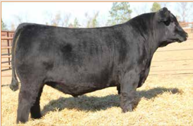
SAV Paternal 4484 – Sire of Lots 74, 76, 77, 78