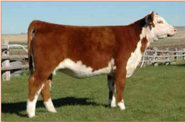
WSF 75T Ladysport G58 ET – Maternal sister to the dam of Lots 25A and 25B