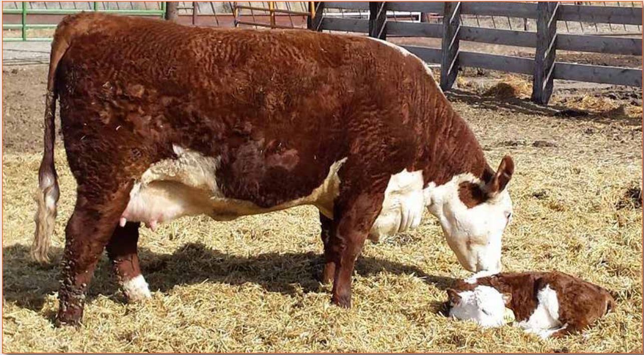
Lot 6 – WSF Proofs Lady Success A31 ET