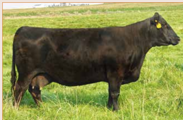
WSF Lady Traveler 624 – Dam of Lots 51, 52, 53, 54, 55, 56, 57