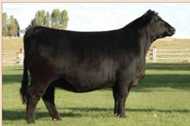
Lot 50A – WSF Divine Lady F17