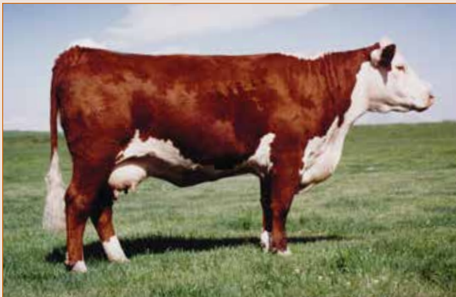
Remitall Catalina 24H – Maternal grandam of Lot 37