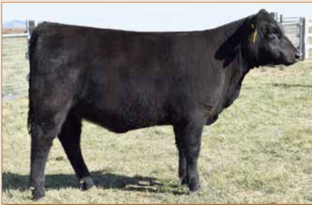
Lot 69 – WSF Lady Primo G14