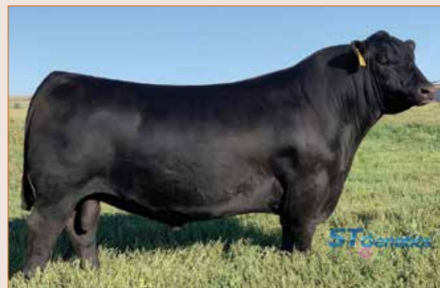
SAV Raindance 6848 – Sire of Embryo Lot 53