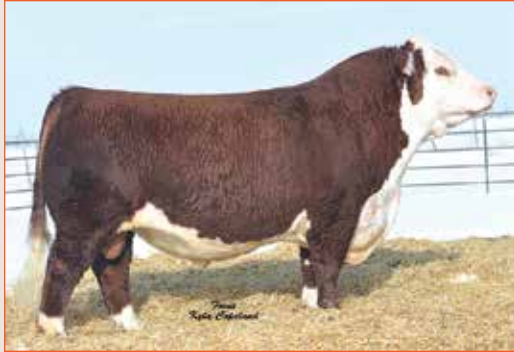
CRR 719 Catapult 109 – Sire of Embryo Lot 7E

CRR 719 CATAPULT 109 (P43186342) WSF LADY SUCCESS 576 ET (P42715834)