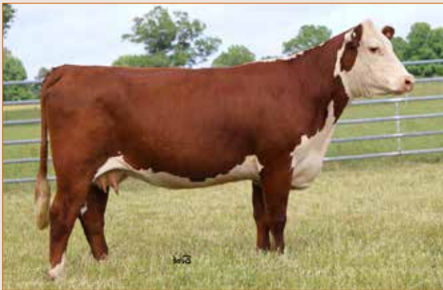
GV CMR 1L Betty 0109 A177 ET – Dam of Lot 35