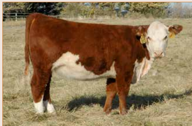
Lot 16A – WSF Lady's Secret G98

TH 71U 719T MR HEREFORD 11X (SOD)(DLF,HYF,IEF) WSF 327N LADY HEREFORD B73 ET P43731718 HAROLDSONS WLC MONA ET 327N (DLF,HYF,IEF)