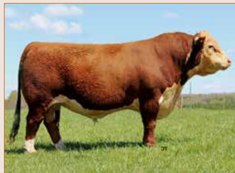
KCF Bennett Encore Z311 ET – Sire of Embryo Lot 5B