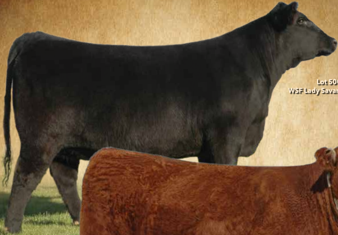
Lot 50C WSF Lady Savannah E318