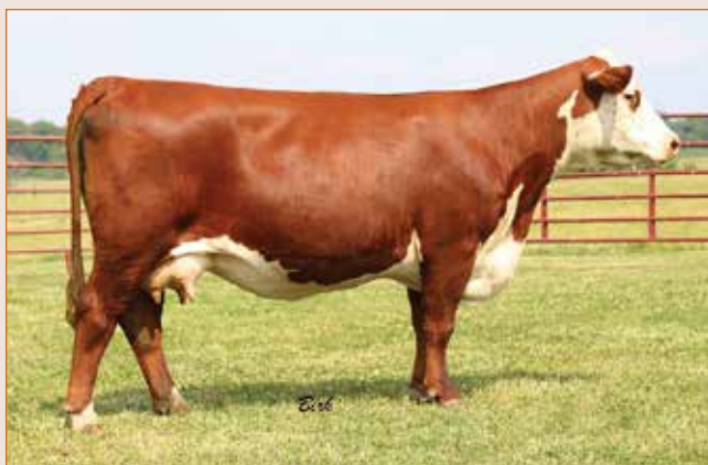
Walker Miss W193 883 168 – Dam of Lot 21