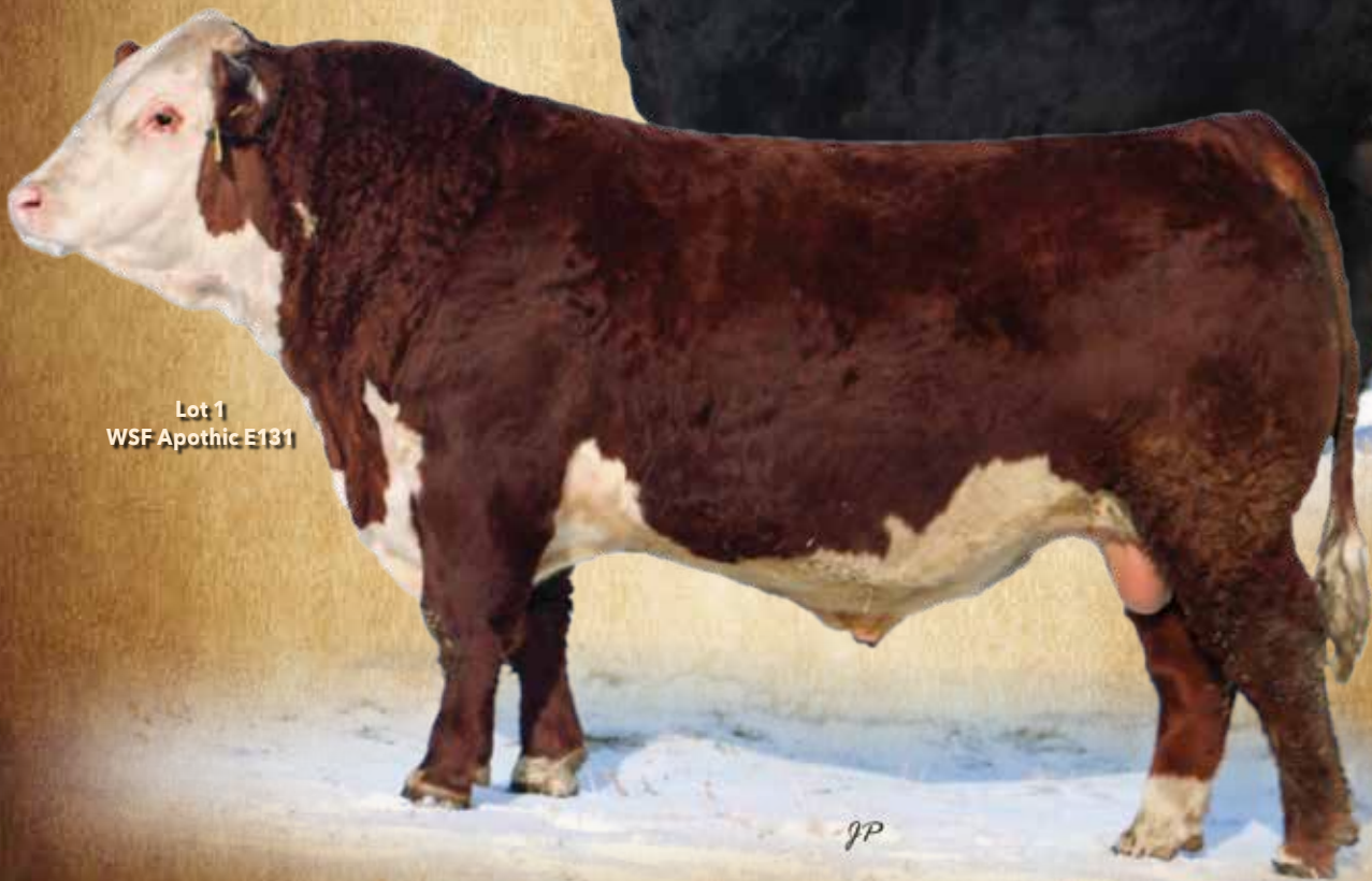
Lot 1 WSF Apothic E131