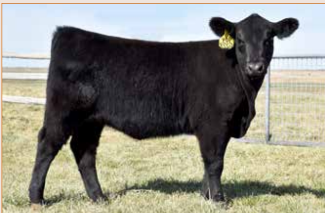
Lot 72 – WSF Lady Everelda G223