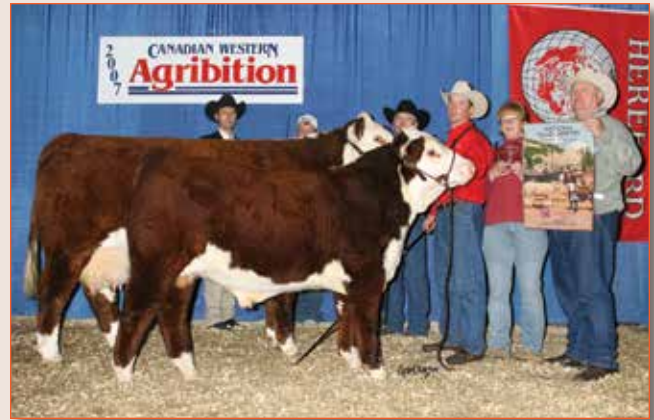
Remitall Marvel 296N – Dam of Lots 1, 3, 4, Donor Dam of Embryo Lots 5A, 5B and 5C