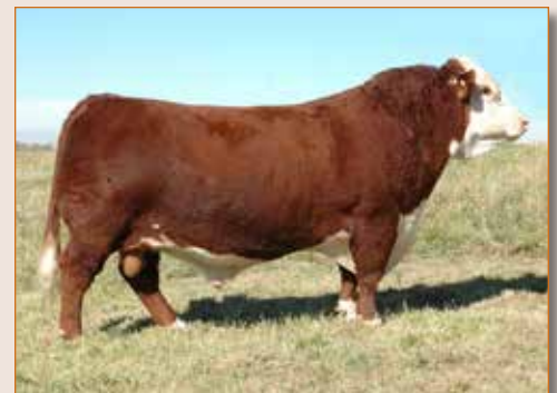
WSF Home Schooled B76 ET – Sire of Embryo Lot 5C