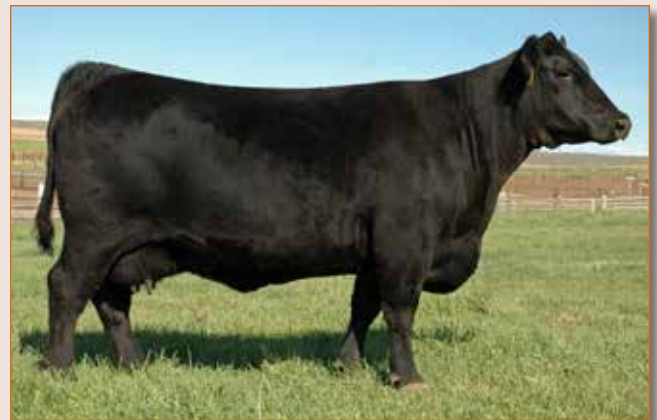
WSF Everelda Lady 904 – Dam of Lot 78