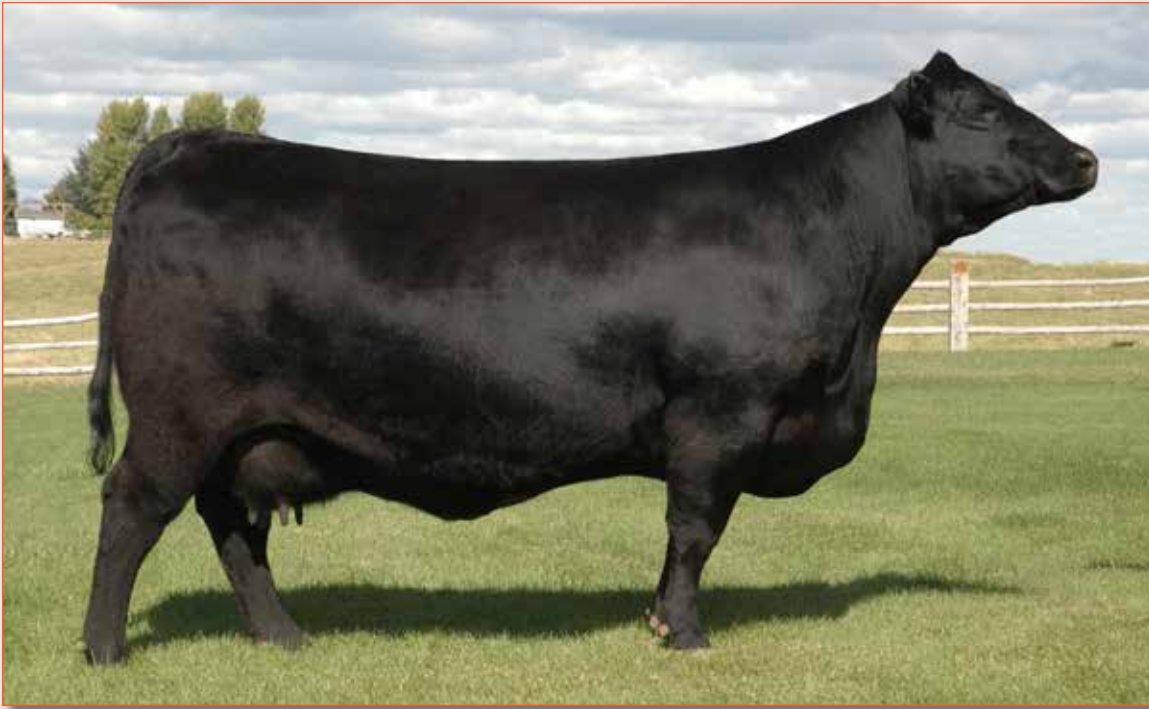
Lot 51 – WSF 624 Miss Resource B18