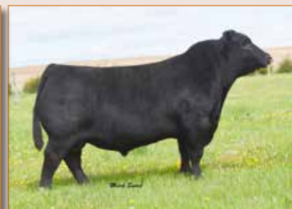
Styles Cash R400