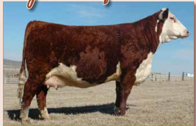
A31 - Maternal sister to Lots 25A and 25B