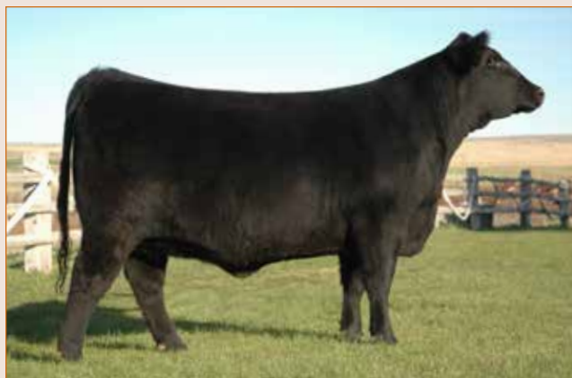
Lot 50C – WSF Lady Savannah E318