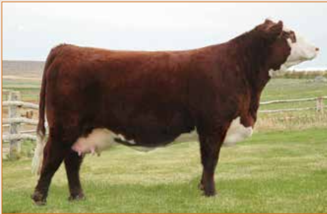
WSF Hereford Lady A114 – Maternal sister to Lot 36