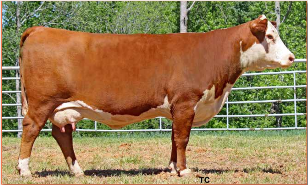
Lot 14 – FPH MS Vicky R1 Ribeye A121 ET