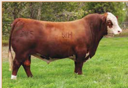
Whitehawk Warrior 845C ET