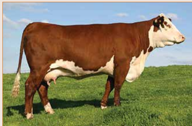
SB 122L Dottie 109N ET – Maternal grandam to Lot 29