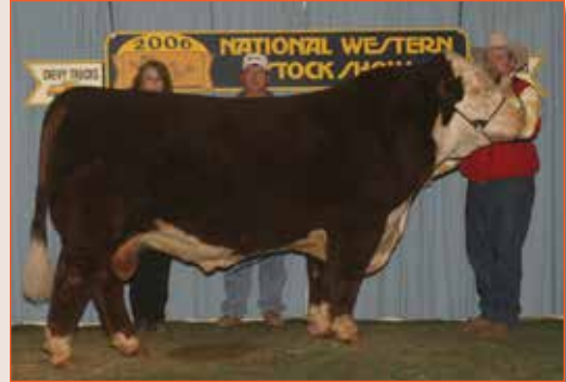
WSF CC Leading Answer 396 ET – Sire of Embryo Lot 7F

WSF LEADING ANSWER 0948 (P42474066) WSF LADY SUCCESS 621F (P23937523)