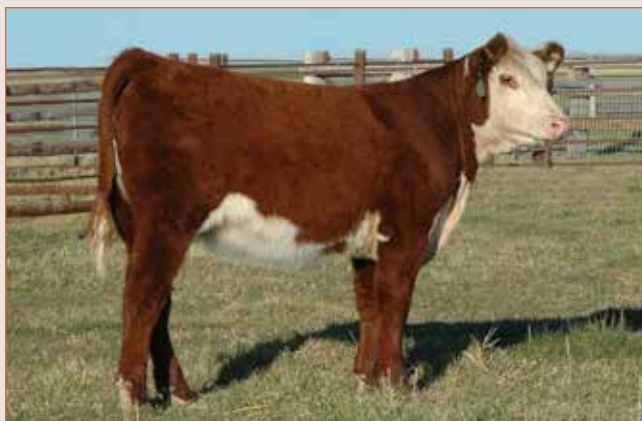
Lot 1A – WSF Marvelous Lady G279