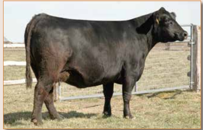
Lot 58 - Malsons Savannah 35A