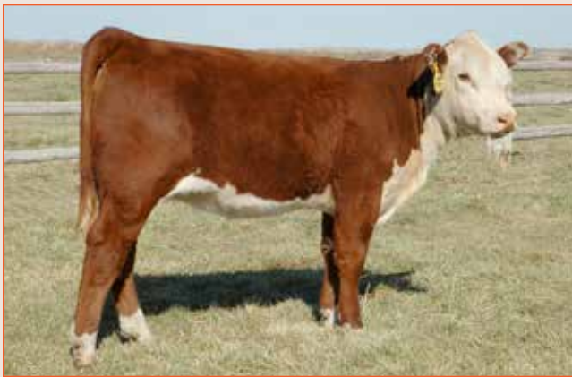
Lot 25A - WSF Lady Success G27 ET