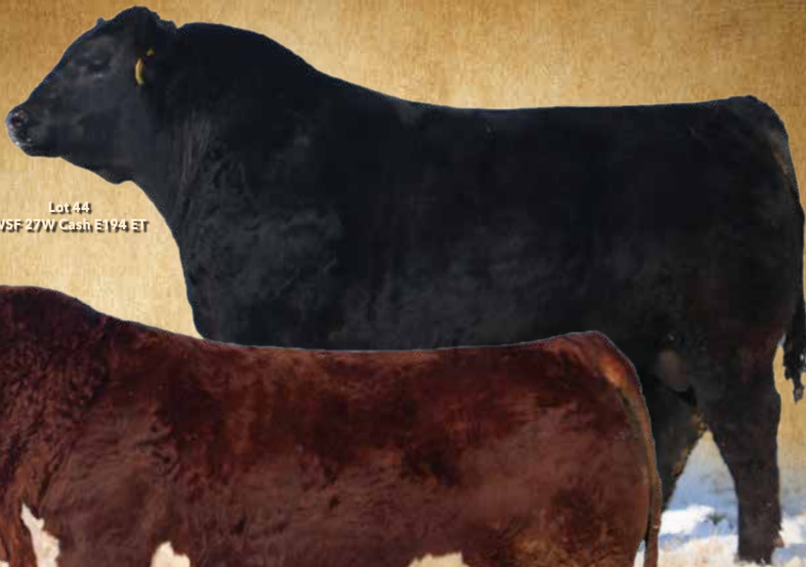
Lot 44 WSF 27W Cash E194 ET