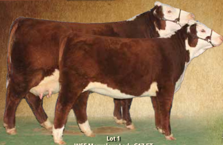
Lot 1 WSF Marvelous Lady C17 ET