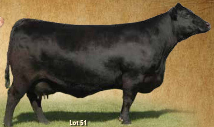
Lot 51 WSF 624 Miss Resource B18