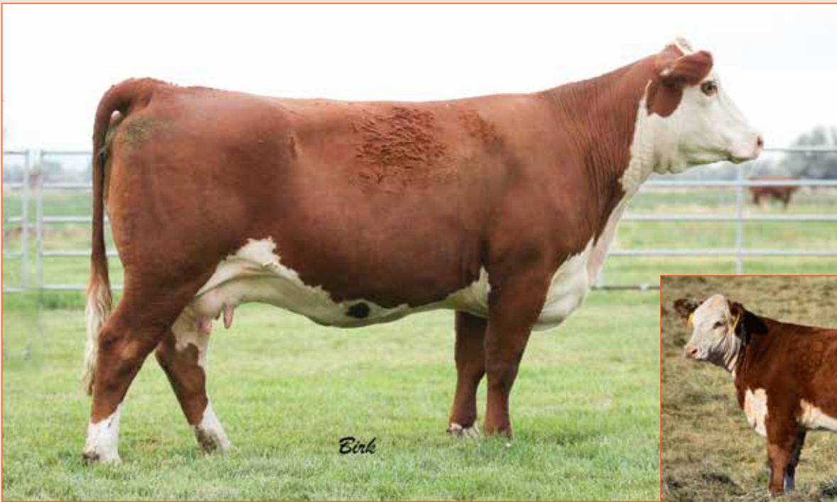
Lot 9 – Mohican Plus 423A ET