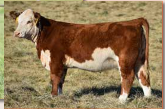
Lot 9A – WSF Lady Time G48