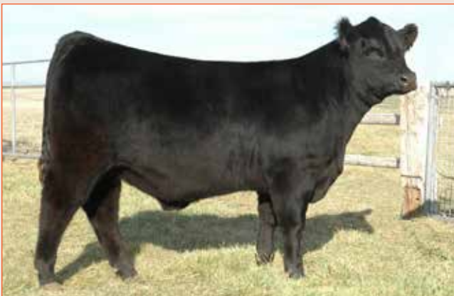
Lot 51A – WSF All In One G47