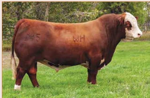
Whitehawk Warrior 845C ET – Sire of Lots 29, 30, 31