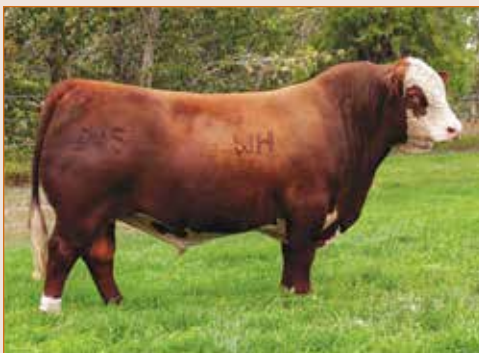
Whitehawk Warrior 845C ET – Sire of Embryo Lot 5A

WSF HOME SCHOOLED B76 ET (P43506386) REMITALL MARVEL 296N (P42896609)