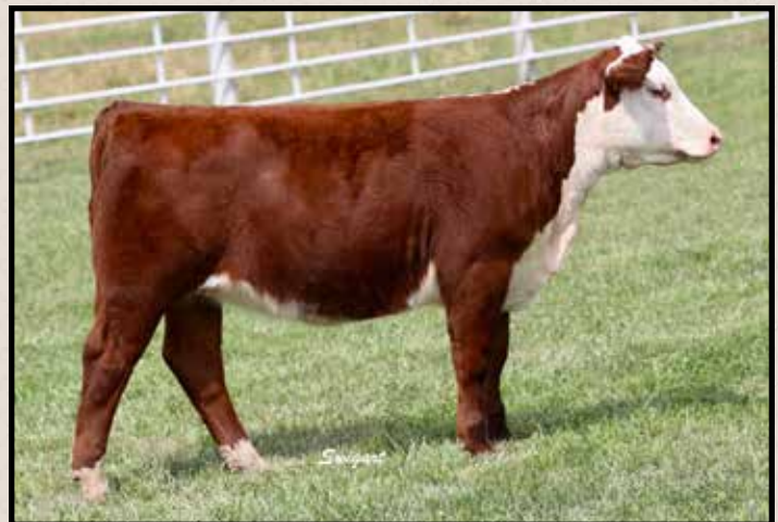
Lot 49A — LCC Suzy Q 914