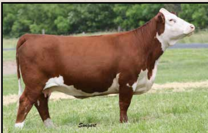
Lot 52 — BH WH 21P Delilah 517C ET