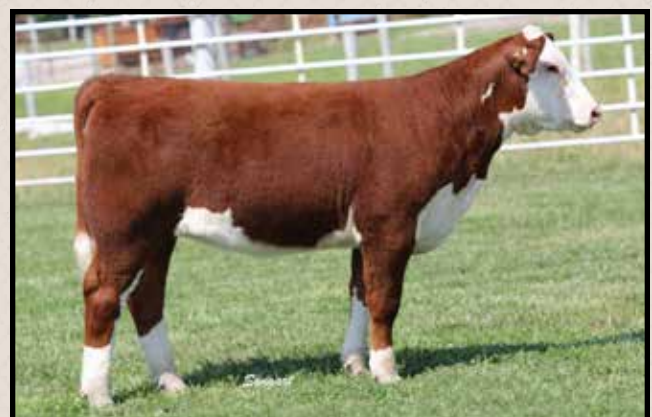
Lot 37A — LCC 1363 Sweet Pie 913