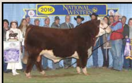
Son of JB Remetee 213 — LCC FBF Time Traveler 480