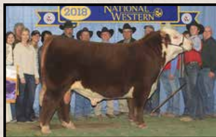
Sire of Lot 6 — B&C Stock Option 6026D ET