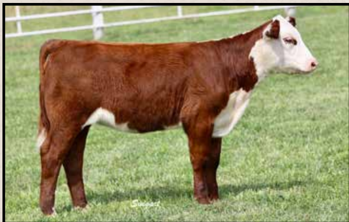
Lot 21A — LCC 22C Kiwi Maker 979