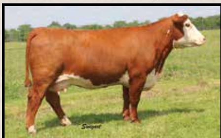
H GO LCC Kylie 2137 — Dam of Lots 9A-9B and Lot 10