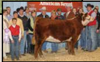
LCC Patton Kiwi 116 ET — Dam of Lots 19, 20 and 21