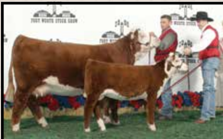
UPS Miss Kootenay 3915 1ET — Dam of 116, Multiple time National Champion and dam of National Champions