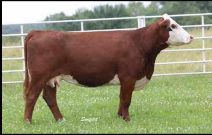
Lot 34 — CAL LCC 2296 Victra 989