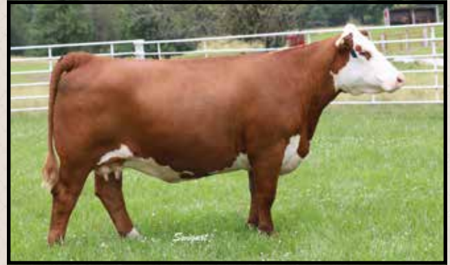
Lot 43 — RTK RRR Annies Diamond 14E