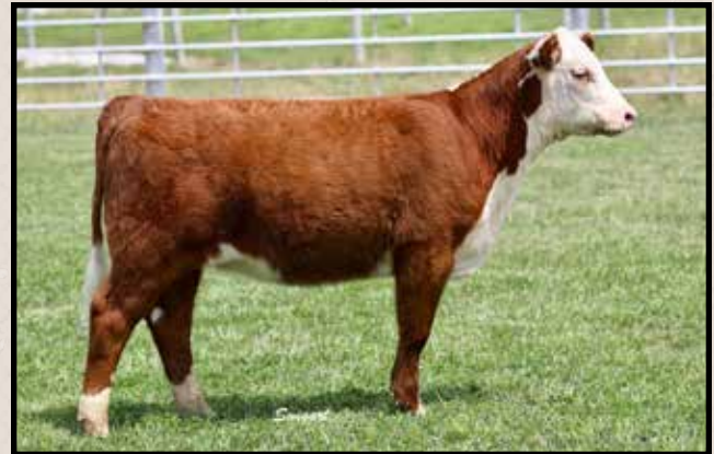
Lot 40A — LCC Miss Fresh Start 909