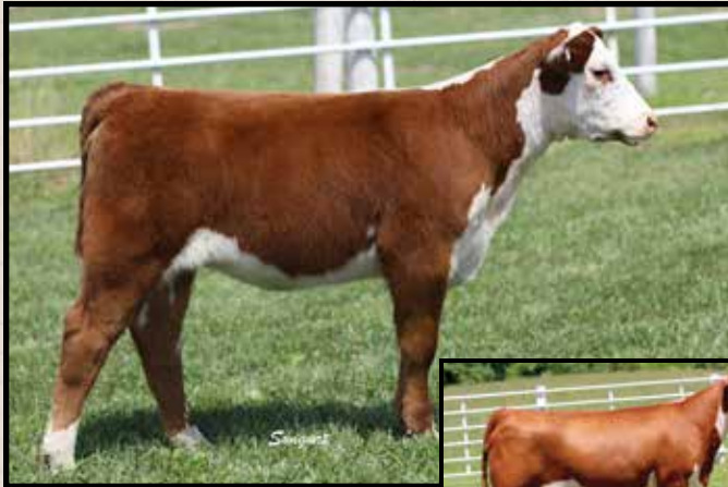
Lot 15 — CAL LCC Ms Vitalized 30G ET