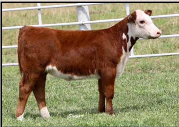
Lot 30A — LCC 4134 Miss Bell 974