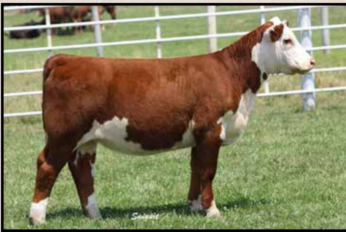
Lot 8A — LCC LRF Sun Set 3G ET