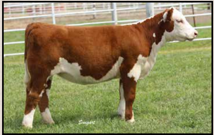
Lot 7A — LCC 1326 Remetee 1G ET