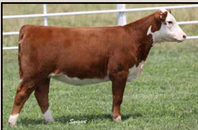
Lot 23A — LCC 5804 Miss Emma Jean 944