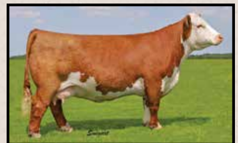
JB Remetee 213 — Grandam of Lots 8A-8C