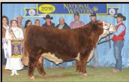
Sire of Lots 7A and 7B — TFR KU Roll The Dice 1326