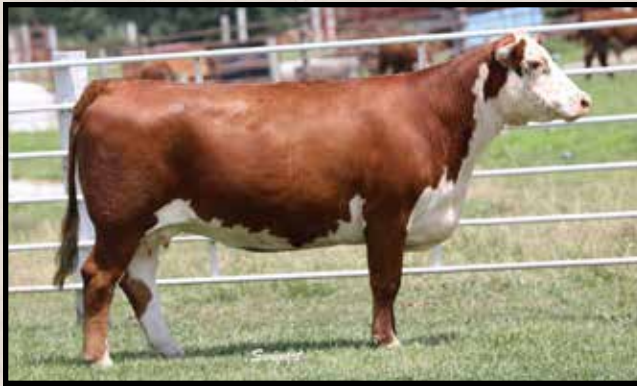
Lot 22 — DJF Becky Bae 74B ET