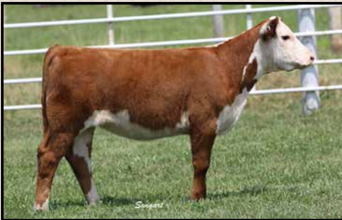
Lot 5B — LCC Center Of Attn 26G ET