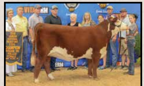
LCC 480 Kiwi 3E ET — Purchased by the Koontz Girls in the 2017 ITC Sale. Maternal Sib to Lots 2A and 2B