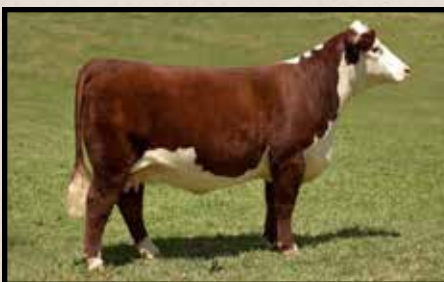
LCC FBF Miss Sun Drop 5160 ET — Dam of Lots 8A-8C