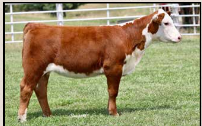
Lot 29A — LCC 5804 Entice Me 953