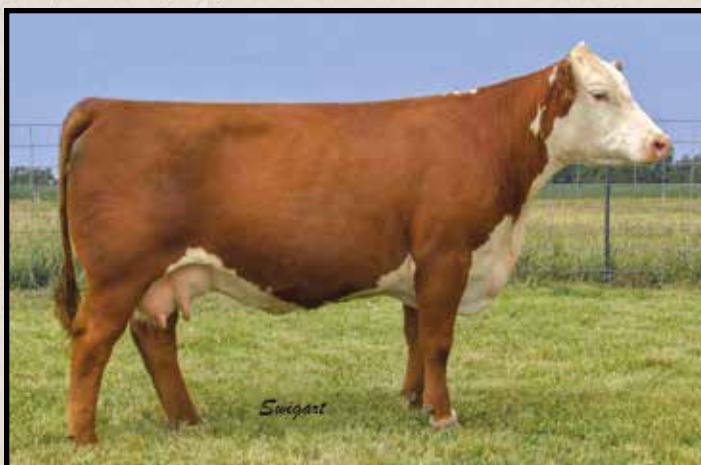
Lot 11 — BLL LCC 76R Miss Remedy 7197