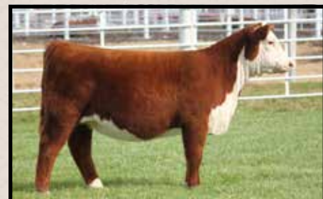
LCC 6964 Queen Bee 43F ET — Maternal sib to Lots 9A-9B and Lot 10 The $120,000 HYFA Lot 1 in the 2019 Mile High Sale, NWSS