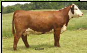
LCC Patton Kiwi 116 ET — Donor Dam