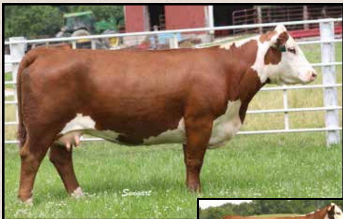
Lot 21 — LCC 0124 Miss Keepin Time504ET