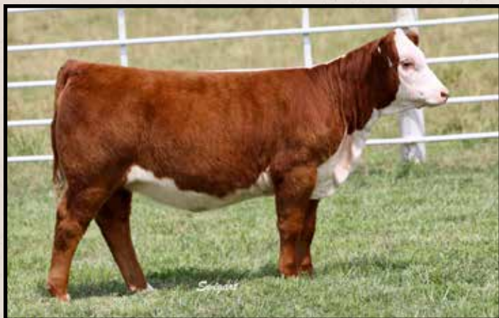
Lot 13A — MKL LCC 480 Travelin Gal 9G ET