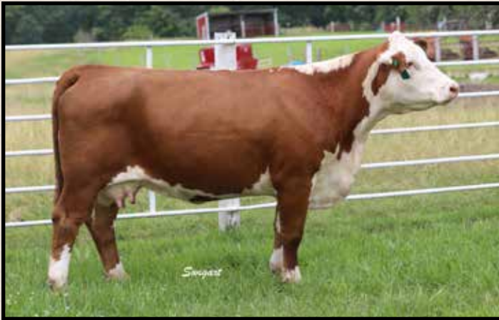
Lot 38 — MF 1306 Charelize GC 511C