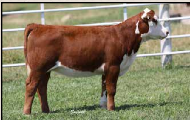
Lot 27A — LCC 174E Ms Frontier Gal 945G

ILLINI TOP CUT 2019 — SEPTEMBER 15, 2019