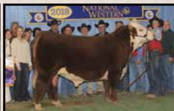
B&C Stock Option 6026D ET — Reference sire to many progeny in the sale