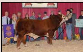
JTH SC Playmaker 22C ET — Sire of Lot 12 and reference sire of many progeny