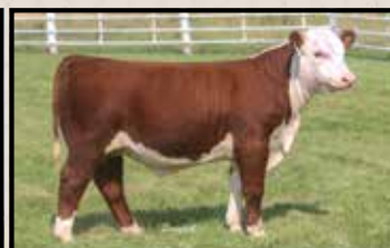
LCC BCC Lumbarjack eF ET — Reference sire to many progeny in the sale