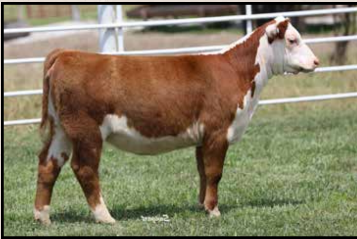
Lot 5A — LCC Front N Center 27G ET