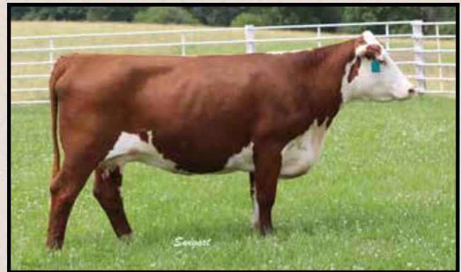
Lot 41 — C Victoria JS 610