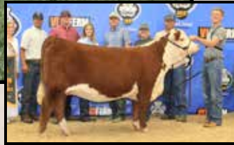
KJ BJ 686Z Cher 753D ET — Dam of Lot 14