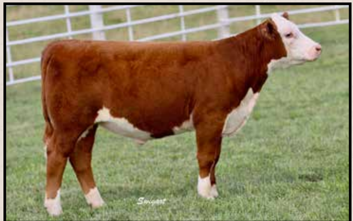
Lot 7B — LCC 1326 Miss Jackpot 15G ET