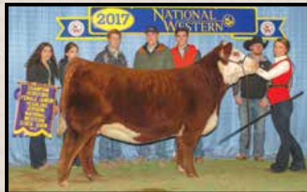
Dam of Lot 4 — LCC SHF Miss Lemon Lime 502 ET