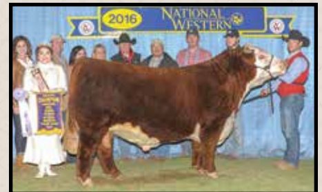
Sire of Lot 4 — TFR KU Roll The Dice 1326