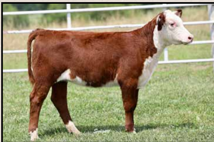
Lot 11A — MKL LCC Remedy 987G