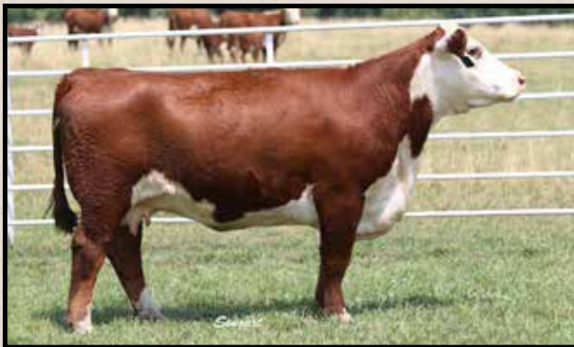
Lot 27 — RST Mat 109 Kat 31C ET