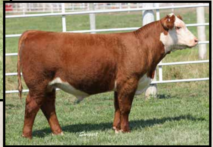
Lot 4 — LCC 1326 Lemonade 5G ET