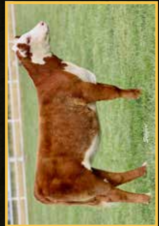
Lot 2A — LCC 6026D Kiwi 21G ET Kiwi Family