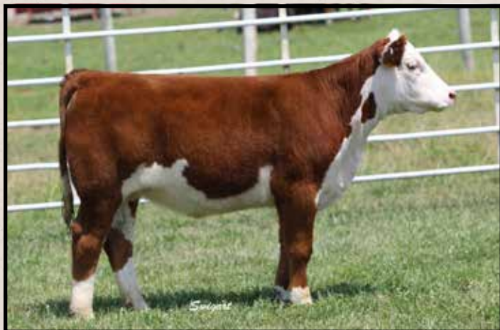
Lot 13B — MKL LCC Travelin Remy 10G ET