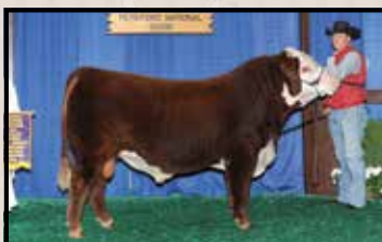
BLL LCC Sin City 4134 ET — Reference sire to many progeny in the sale