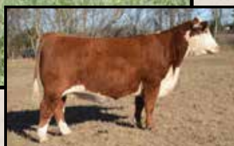
BBH 743 Adora 339A — Dam of Lot 16