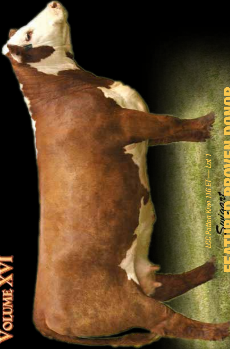
LCC Patton Kiwi 116 ET — Lot 1