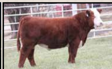
LCC 44573 Leonard Wood 48F ET — Reference sire to many progeny in the sale