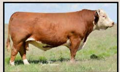
Sire of Lots 5A-5C — BR Copper 124Y