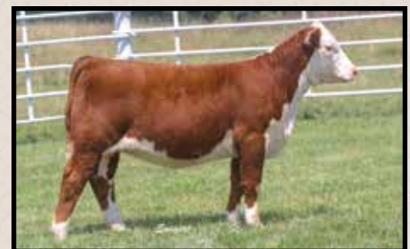
Maternal sib to high seller in 2018 Sale