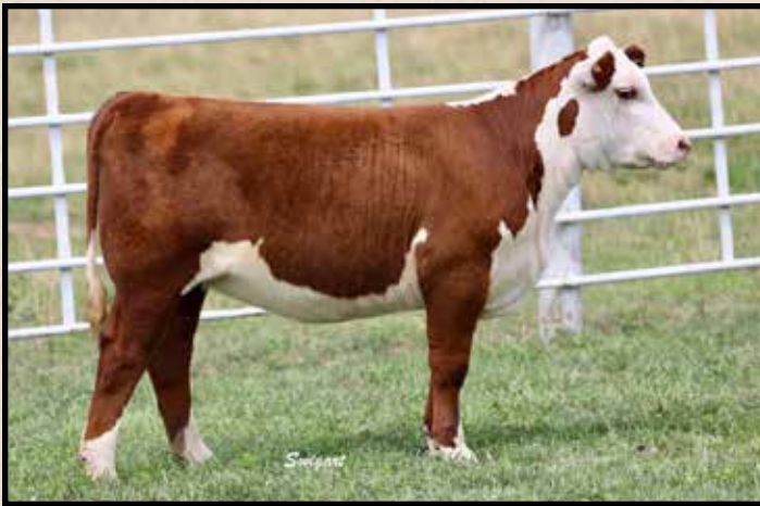
Lot 8B — LCC LRF Sun Drop 2G ET