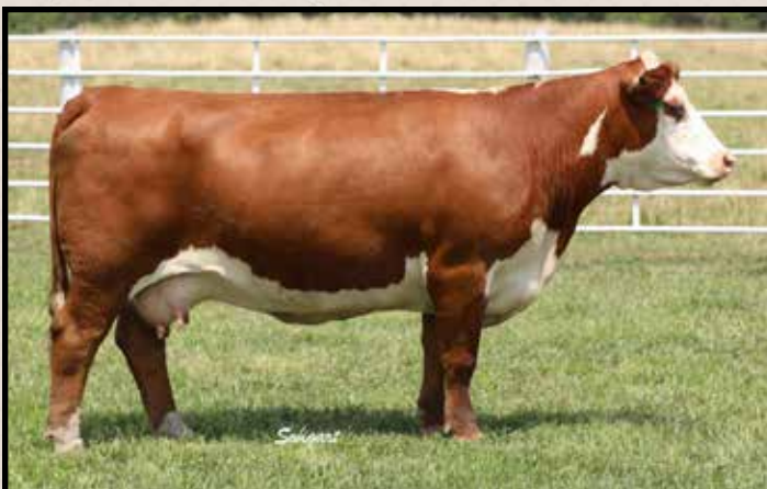
Lot 20 — LCC SHF TR Sweet & Sour 532