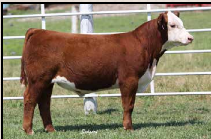
Lot 13C — MKL LCC Traveling Man 12G ET