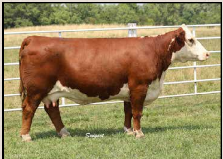
Lot 18 — SULL Diana 5469 ET