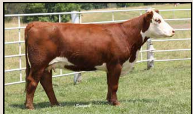
Lot 33 — LBB CFF 38Y Tilly 04D ET