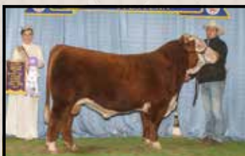
H2 10Y 7183 Doc Holliday 5804 — Reference sire to many progeny in the sale