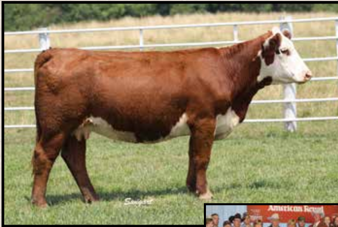
Lot 19 — LCC 480 Berry Patches 705 ET