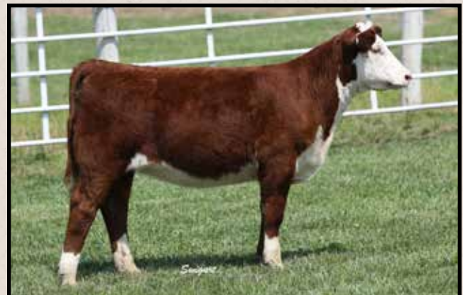
Lot 41A — LCC 118E Sparkles 973