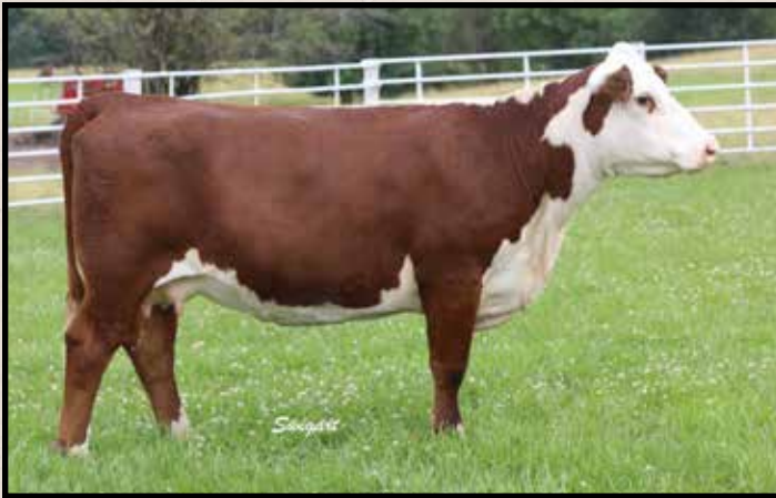
Lot 30 — LCC A322 Ms Bell 690