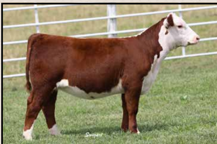
Lot 12 — MKL LCC Makin Memories 18G ET