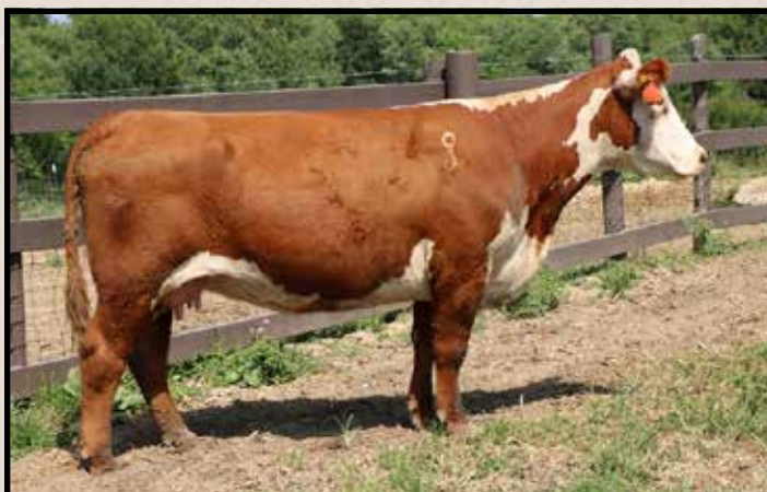
Lot 58 — GKB JKL B123 Lady Avenue 81B