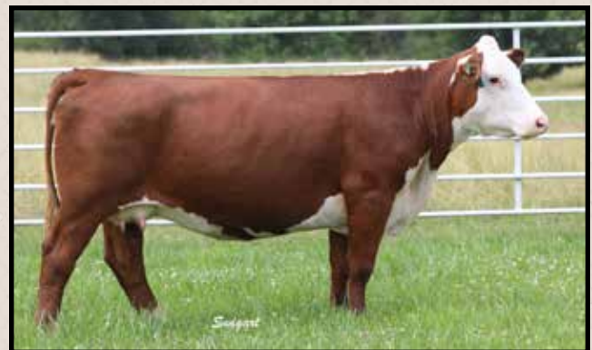
Lot 29 — CLF GCC Miss Enticer C401