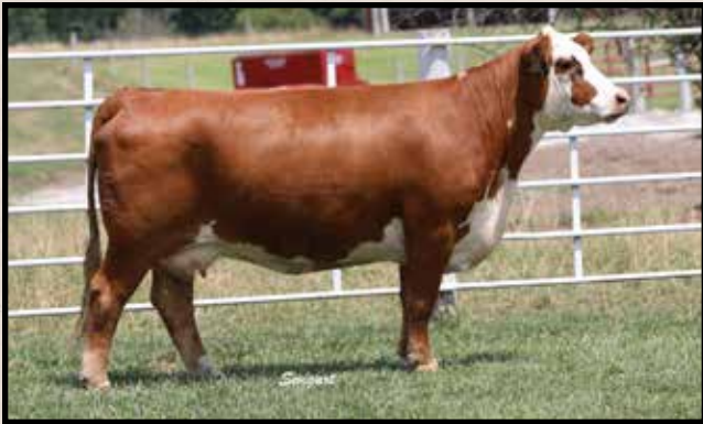
Lot 44 — CHEZ Cally 542C