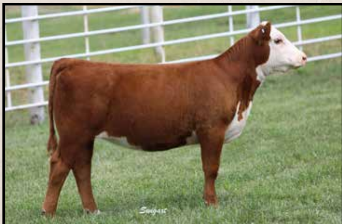
Lot 9A — LCC 612 Roll On Kylie 7G ET