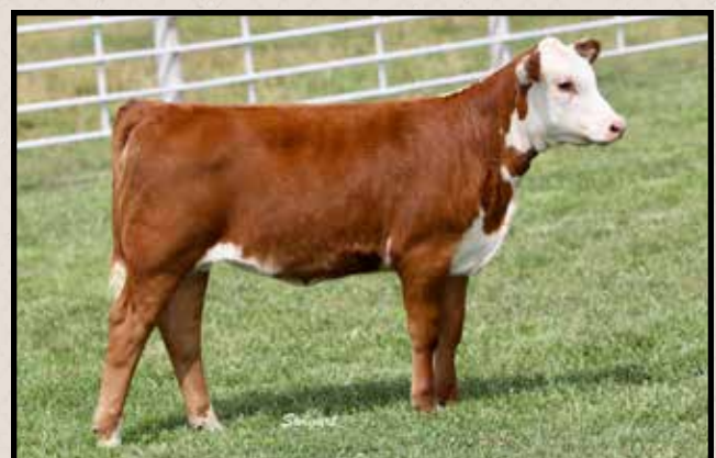
Lot 33A — LCC 624 Miss Tilly 984