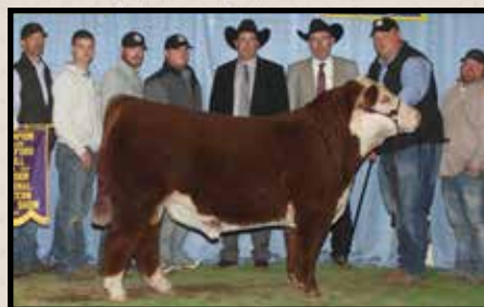
KOLT Chicago 2004 ET — Sire of Lots 8A-8C