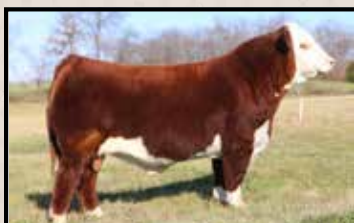
LCC FBF Time Traveler 480 — Reference sire to many progeny in the sale