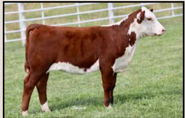
Lot 32A — LCC 1363 Pretty Lady 951