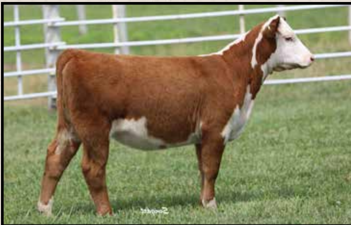
Lot 5C — LCC Miss Outburst 25G ET