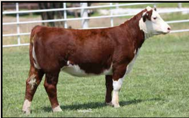
Lot 26A — LCC Clean Livin 904