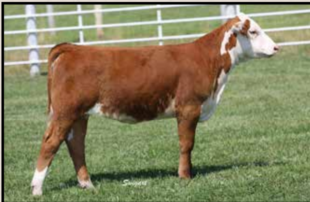
Lot 22A — LCC 6026D Miss Sure Stock 954