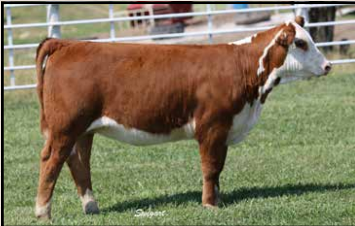
Lot 19A — LCC 028X Sugar Sweet 908