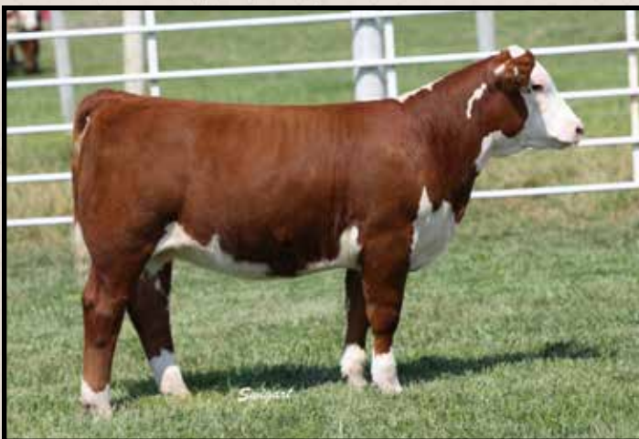
Lot 39A — LCC 5804 Miss Diva 968