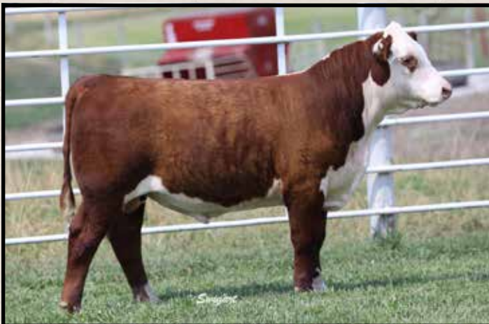
Lot 8C — LCC LRF Shytown 8G ET