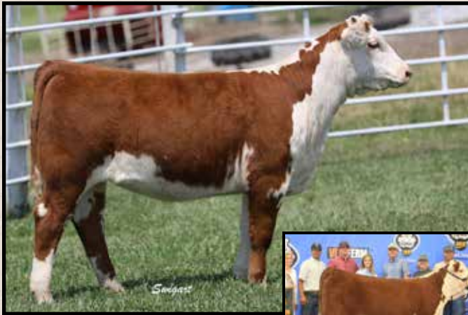
Lot 14 — LCC TJ CAL Cher 17G ET