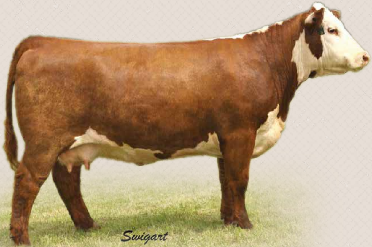
Lot 1 — LCC Patton Kiwi 116 ET