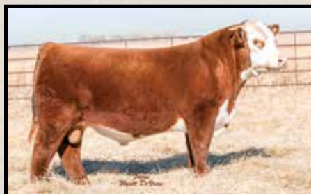
CRR 028X Roll Tide 612 — Sire of Lots 9A-9B