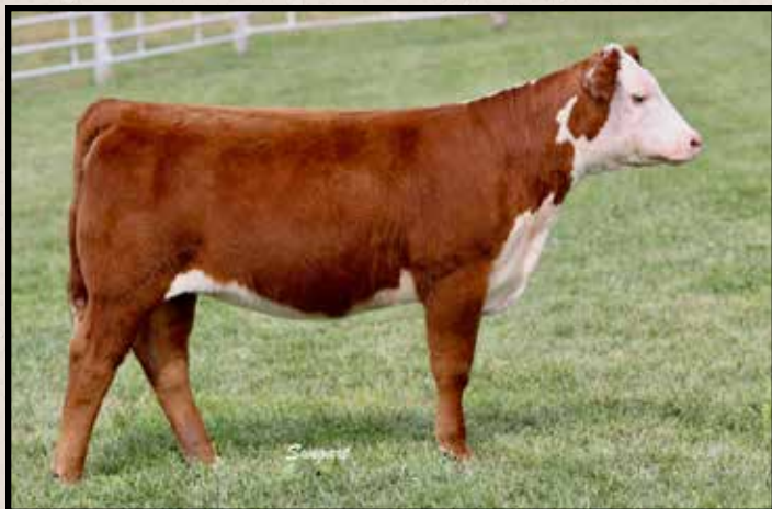
Lot 9B — LCC 612 Kylie's Tide 23G ET