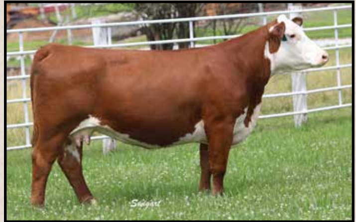
Lot 49 — RJ W Suzette 6032 ET