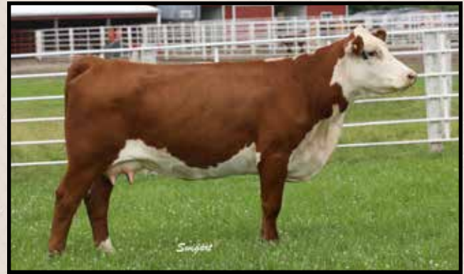
Lot 32 — DS 109 Lady 18D