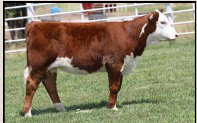
Lot 28A — LCC 7E Trinity 905