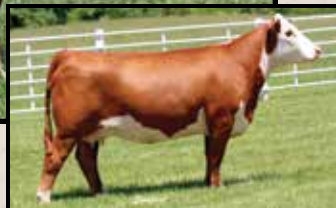
Purple WRB RH Genesis 2714 ET — Dam of Lot 15