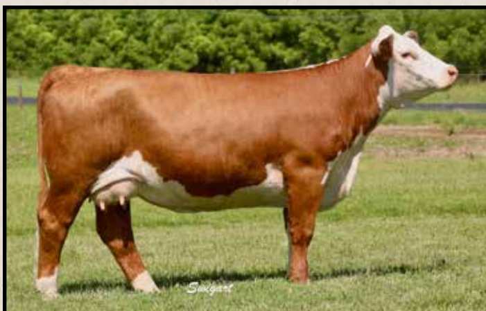
Lot 51 — BH 17R Kit Kat 02D