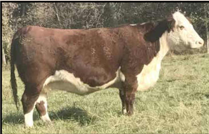
MF 308N Addy 1302 ET — Donor Dam of Lot 35