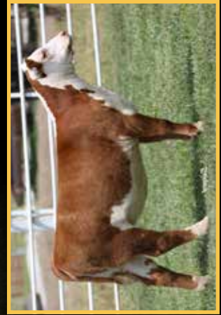
Lot 5A — LCC Front N Center 27G ET Remetee Family