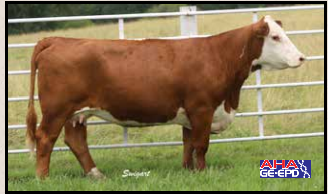
Lot 28 — Grand Trinity D10