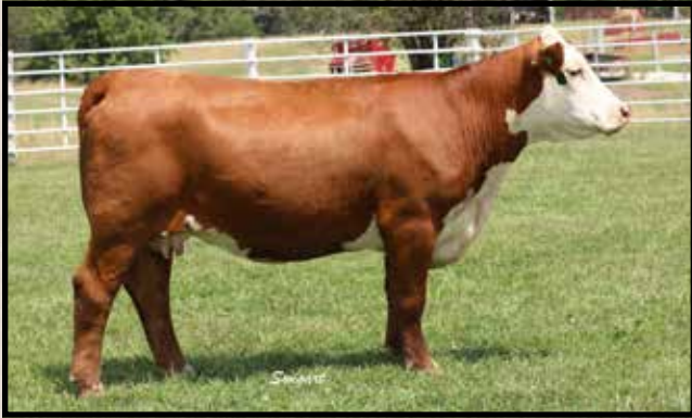
Lot 42 — HAPP 1307 Evelyn 3E ET