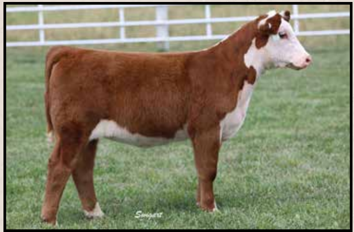
Lot 6 — LCC 6026D Miss Option 22G ET