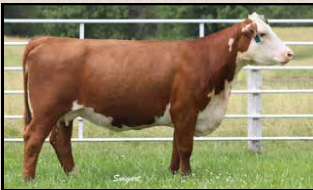
Lot 23 — DJF Emmalina 24D