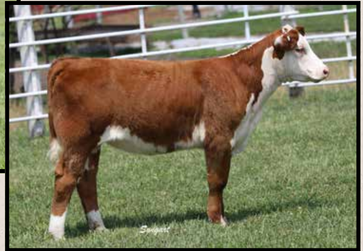
Lot 2B — LCC RL Kee Wee's Option 23G ET

STAR BRIGHT FUTURE 533P ET (SOD)(DLF,HYF,IEF) LCC MERRY TIME 244 (DLF,HYF,IEF) GRANDVIEW 70AKS SONORA 145R (SOD)(CHB)(DLF,HYF,IEF) PATTON KIWI 502 (DLF,HYF,IEF)