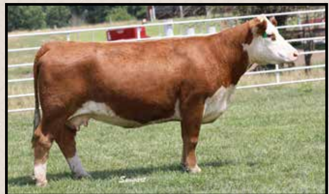
Lot 37 — AF 415W L61 Timer 2041 ET