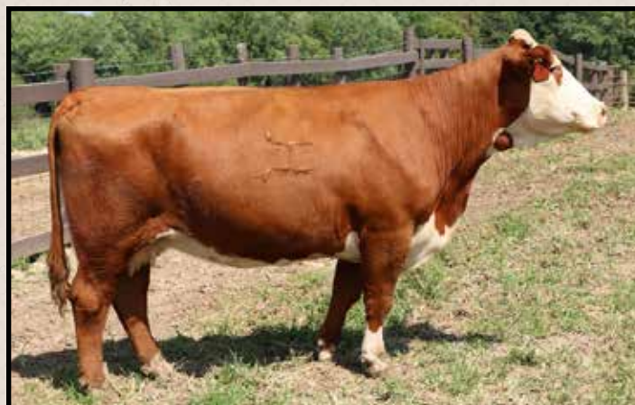
Lot 54 — PRCC 476 Steppin UP 846F