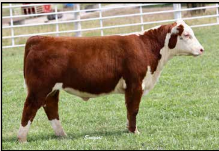
Lot 38A — CAL LCC Confirmed 911