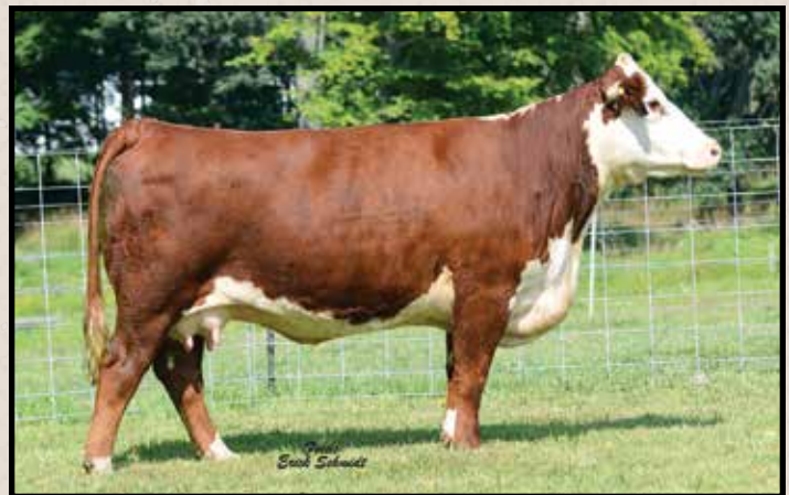
Lot 18 — C&T 86S Latte 28U