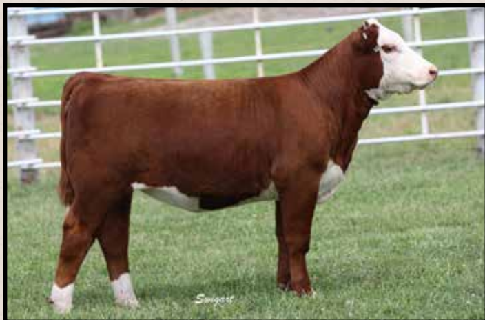
Lot 10 — LCC 2214 Kylie Sue 4G ET