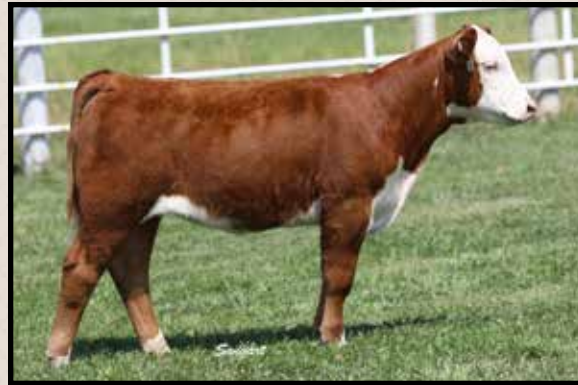
Lot 25A — LCC 5804 Miss Payday 982