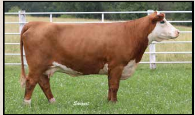
Lot 45 — RJ Holly 5014 ET