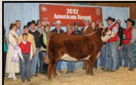
LCC Patton Kiwi 116 ET — "Miss Grand Island" National Reserve Champion Female and Dam of National Champions