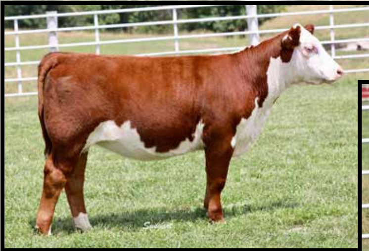
Lot 3 — RL Timin Kiwi 17G ET