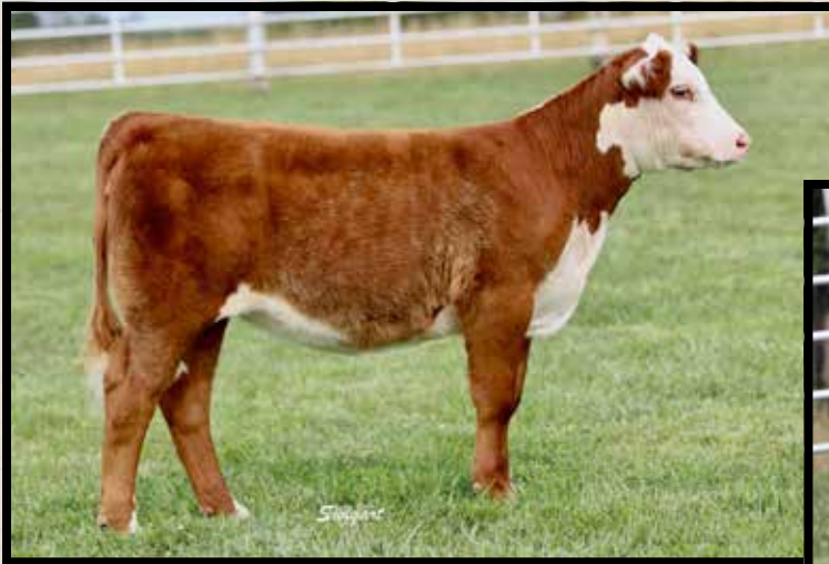
Lot 2A — LCC 6026D Kiwi 21G ET

C STOCKMAN 2059 ET (CHB)(DLF,HYF,IEF) B&C STOCK OPTION 6026D ET (DLF,HYF,IEF,MSUDF) 43719224 B&C MISS TOP GUN 2031Z 1ET (DLF,HYF,IEF,MSUDF)