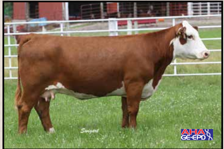
Lot 17 — SULL Diana 5469 ET