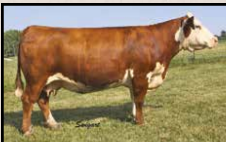
Patton Kiwi 727 — Granddam of Lots 2A and 2B