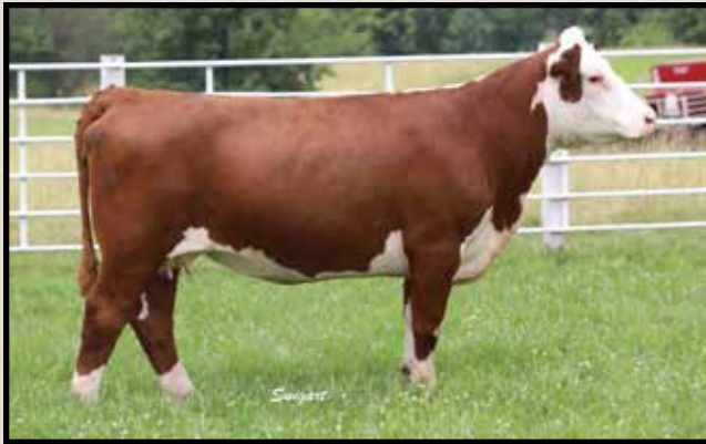
Lot 26 — LCC B293 Ms Dancin Girl 8D ET