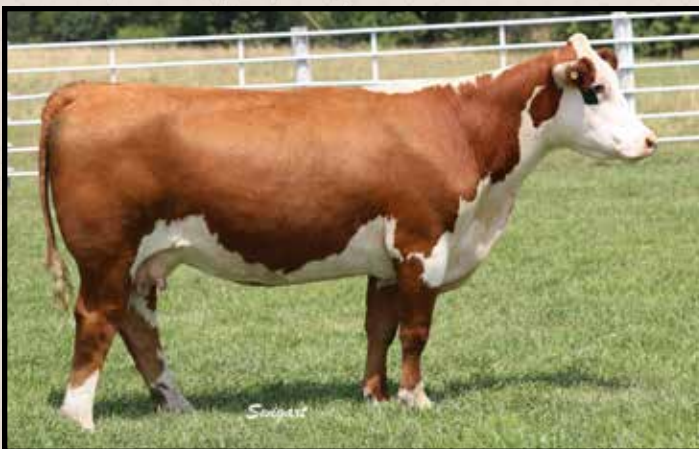
Lot 31 — SRF Katie 8GWZB