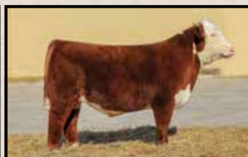
K Rustic 711 ET — Reference sire to many progeny in the sale