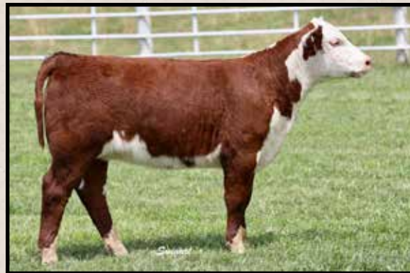
Lot 24A — LCC 118E Mermaid 960