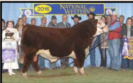
Sire of Lot 3 — LCC FBF Time Traveler 480