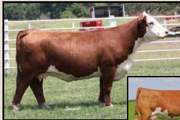
Lot 25 — LCC FBF Sweet & Salty 573 ET