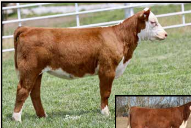
Lot 16 — RJL LCC 22C Adora 24G ET