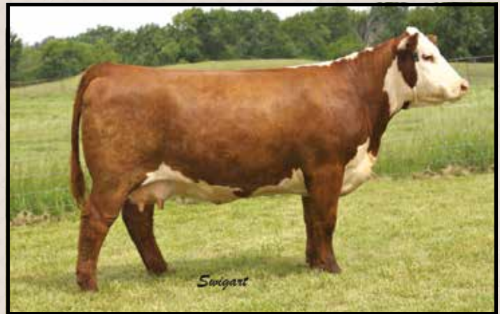
LCC Patton Kiwi 116 ET

Horned — Calved: 3/1/19 Sire: PERKS 0003 EASY MONEY 4003 Dam: SULL TCC MS HARLEY 310 ET