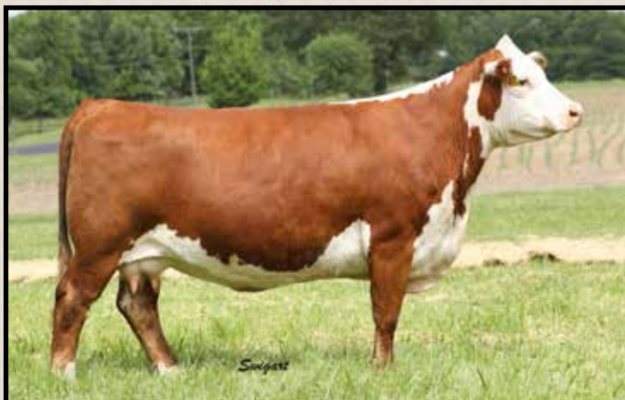
Lot 50 — BH 104K Gloriana 03A