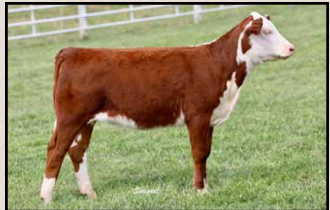
Lot 36A — CAL LCC Queen Lanore 948