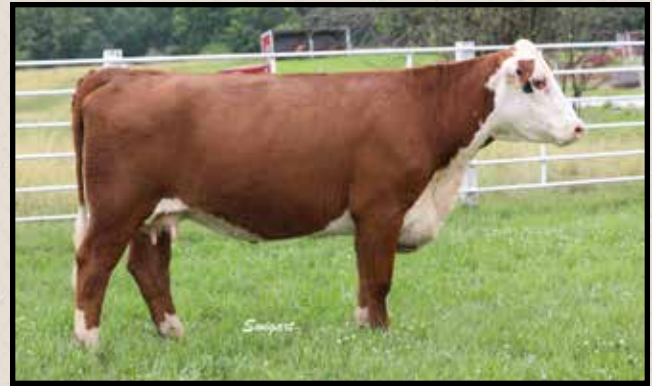
Lot 40 — C Sarah Gold JS 609