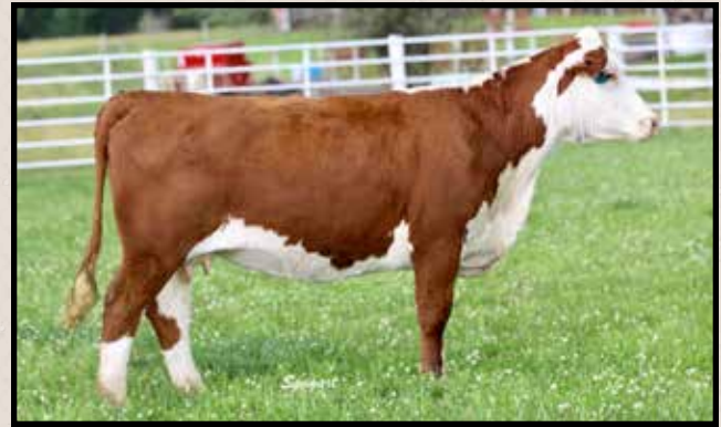
Lot 36 — CAL LCC Miss Lanore 613