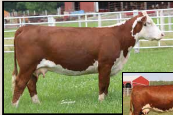
Lot 24 — LCC SHF Ariel 5159