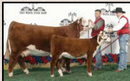
UPS Miss Kootnay 3915 1ET — Great Grandam of Lots 2A and 2B