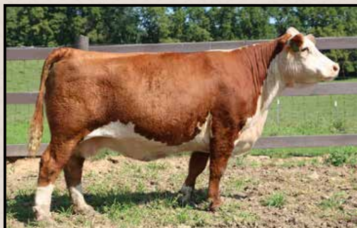
Lot 53 — Bar-S Ms 5216 922