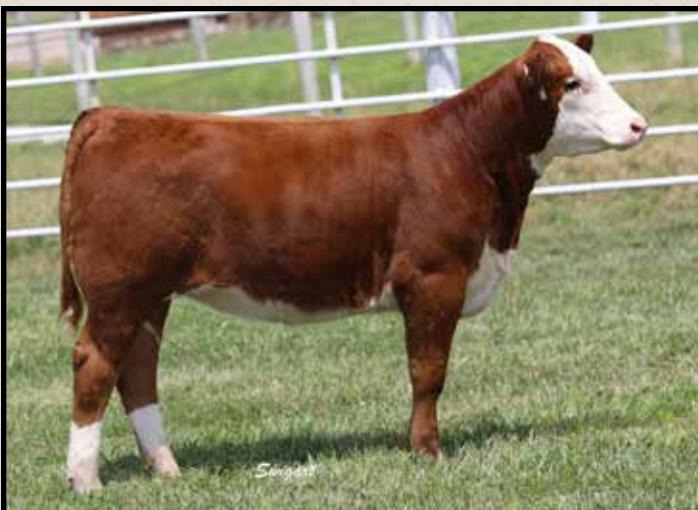
Lot 35A — RJL TJ LCC Addy 955