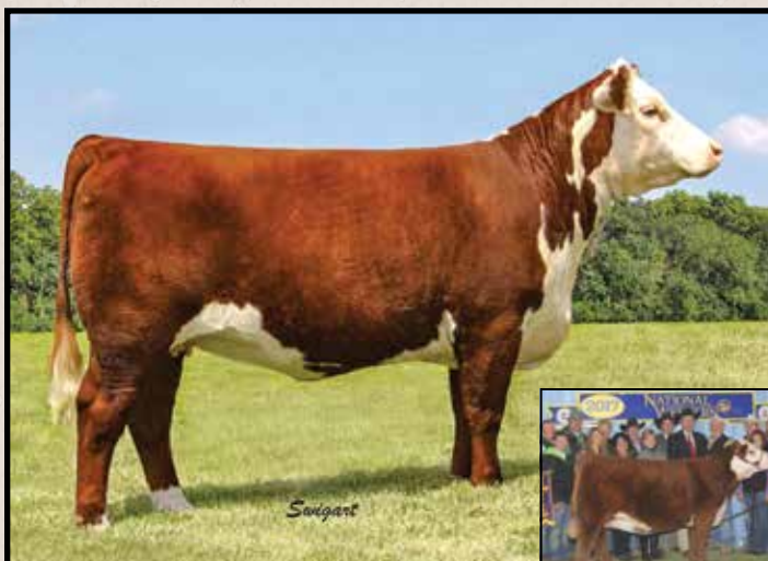
SRH Miss Kitty 1001 ET "Lady Gaga" — Dam of Poker Face