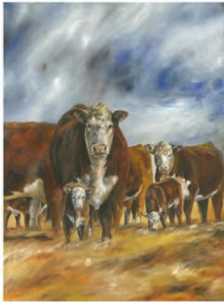
Commissioned by the NJHA, the original 30- by 40-inch “Not Just a Day Dream” painting sold for $20,500 at the JNHE award’s ceremony.