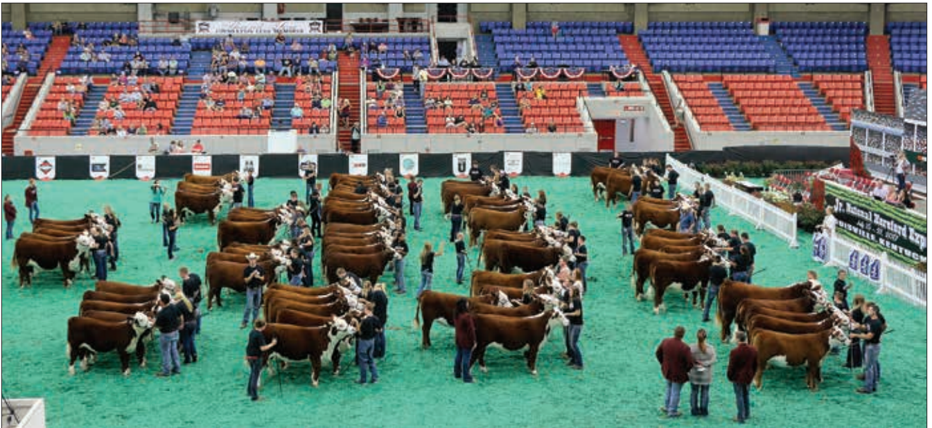
State group classes will represent each state during opening ceremonies at this year's JNHE.

will have two divisions: large state division and small state division.