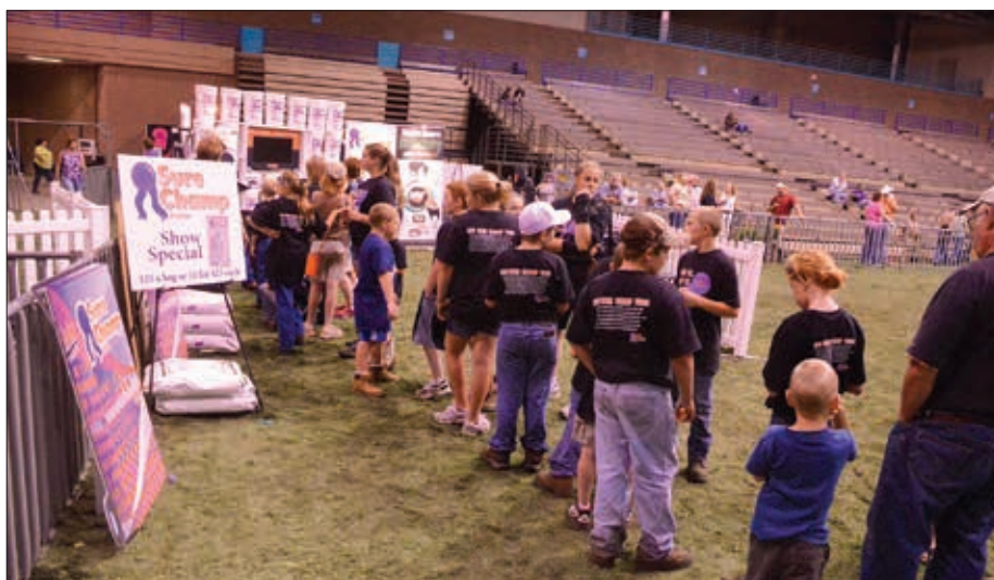
The SureChamp wheel at JNHE gives juniors a chance to test their animal science knowledge.