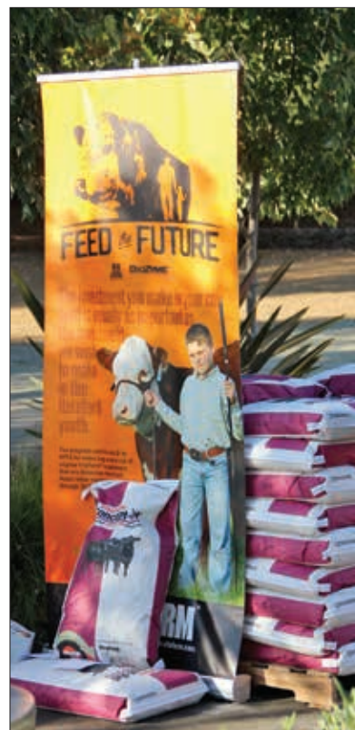
To kick off the Feed the Future program, a pallet of VitaFerm Concept-Aid® mineral was auctioned off at The Harvest II event Aug. 27 in Sonoma, Calif.