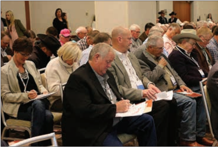
Delegates from across the U.S. elected three new AHA Board members during the AHA Annual Meeting on Oct. 29.