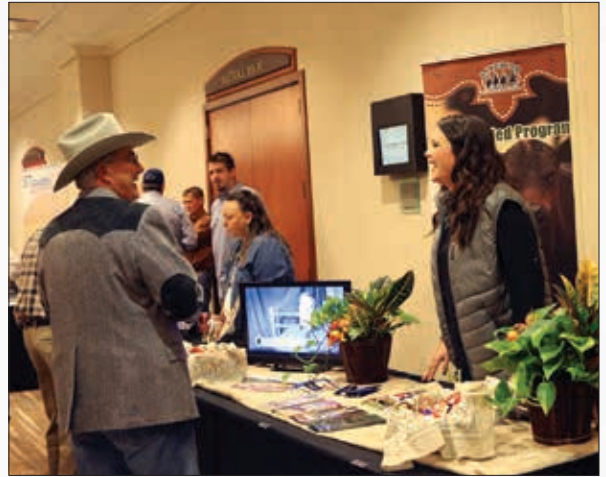
New this year, the AHA hosted an industry trade show providing attendees an avenue to "Talk Hereford."

the Annual Meeting. A PDF of the presentation slides summarizing the committee updates is available online at Hereford.org/AnnualMeeting .