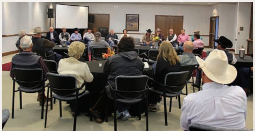
The AHA Board hosted a Q&A session Oct. 30 for members to ask questions and provide feedback.