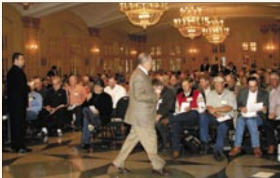
State delegates cast their votes for the three Director positions.

The pages that follow highlight the weekend's activities. HW