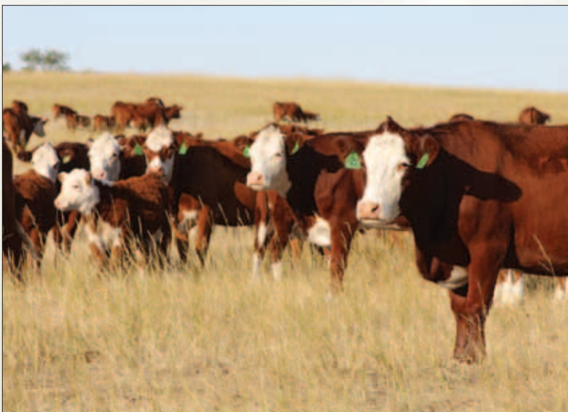
Tuesday morning on the way to the ranch, media had a chance to take photos and video of a group of mature cows with calves. It was a picturesque setting with great Hereford genetics on display.