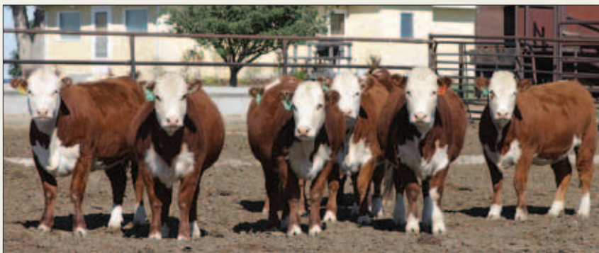
Each year the Olsens develop about 300 replacements. They typically keep 150 and then market the other 150 as bred heifers.