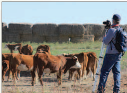
At the ranch, media had a chance to photograph and video younger cow-calf pairs, steers and replacement heifers.

associations to discover the genomic markers that are economically relevant to the Hereford breed.”