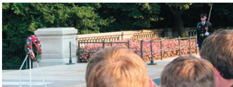
The changing of the guard at the tomb of the unknown soldier was looked on with much respect and admiration from the young Hereford leaders. HW