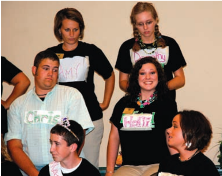
The NJHA board opened the PRIDE Convention with their version of Hollywood Squares, which was a real crowd pleaser as they portrayed Hereford staff and other Hereford celebrities.