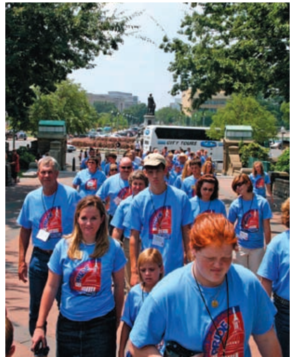
PRIDE delegation walks to the top of Capitol Hill.