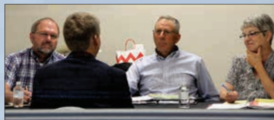
Scholarship finalists were interviewed by a panel of judges.