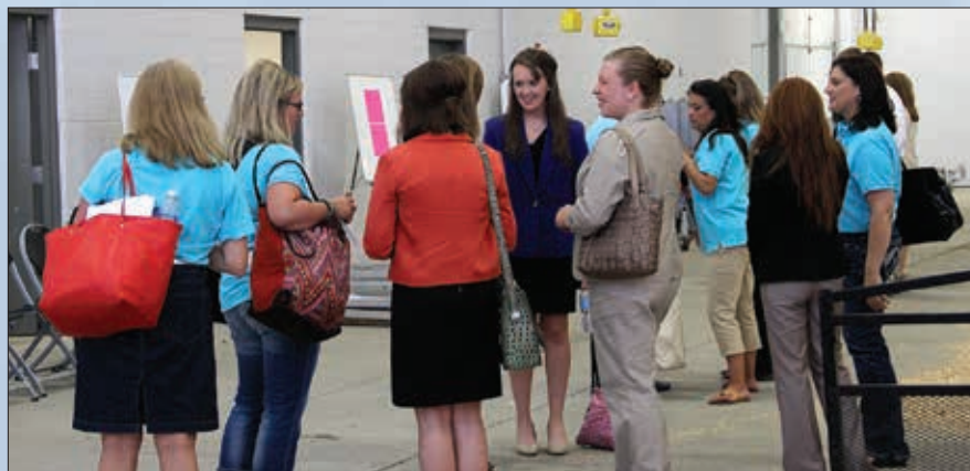
Scholarship finalists interact with members of National Hereford Women prior to interviews.