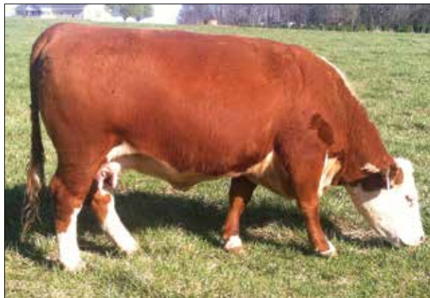
A typical Trask-bred female — one that will thrive in the southeastern U.S.

"I think it is just dumb luck that I happened to be standing there, but my area is beef cattle genetics, so I like to think there was some logical reason somewhere on paper that I get to work with them," he humbly credits.