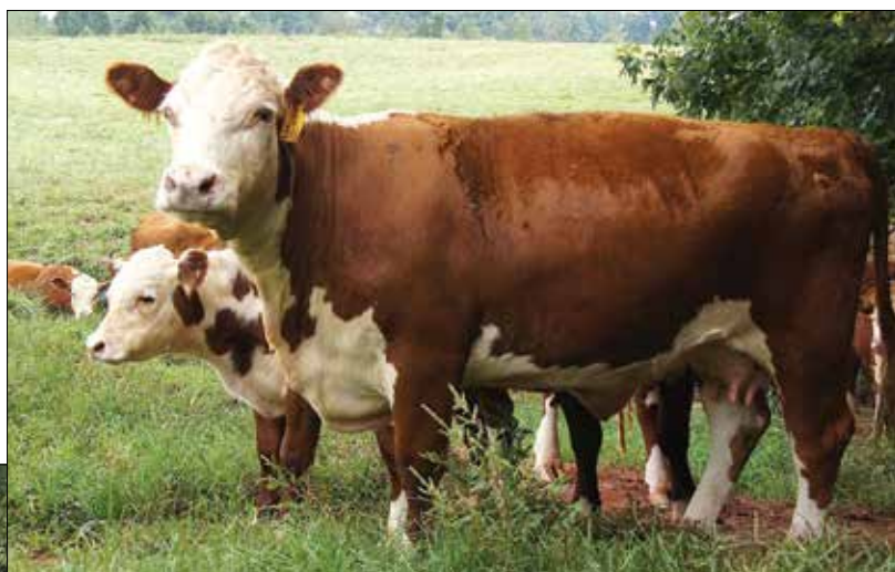
The Clemson Hereford herd is providing a research and teaching platform for improving cattle genetics in South Carolina.