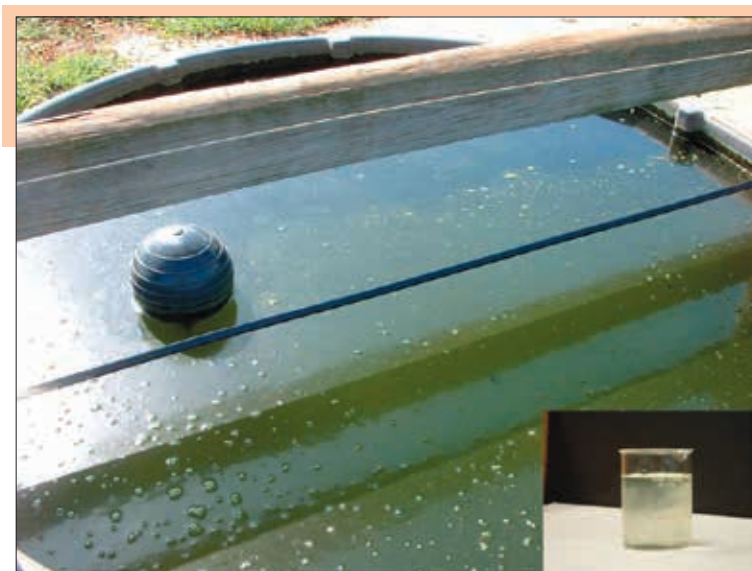
Figure 2: Tank watering system and photo (inset) of water sample.