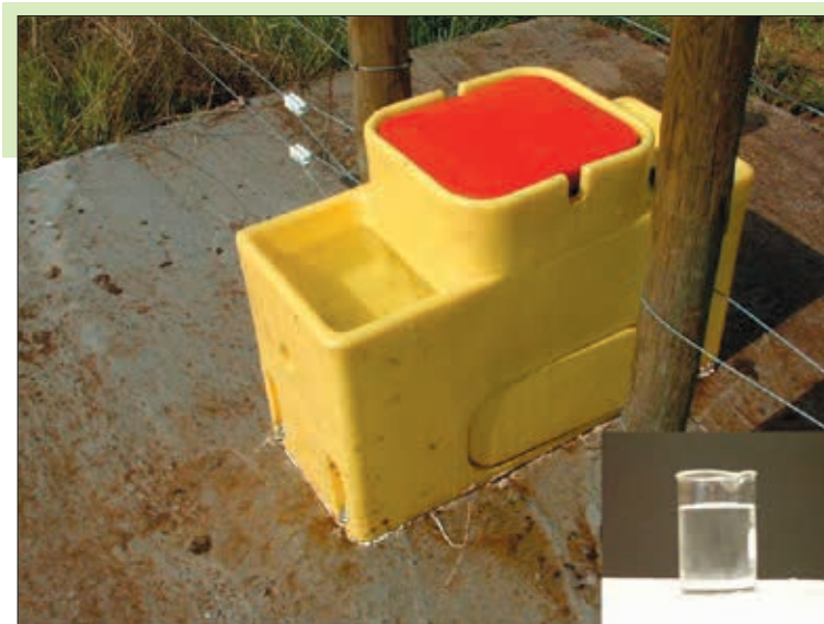
Figure 1: Fountain watering system and photo (inset) of water sample.

Editor's note: This was originally published as "The Impact of Water Quality on Beef Cattle Health and Performance." This document is AN187, one of a series of the Animal Sciences Department, UF/IFAS Extension.