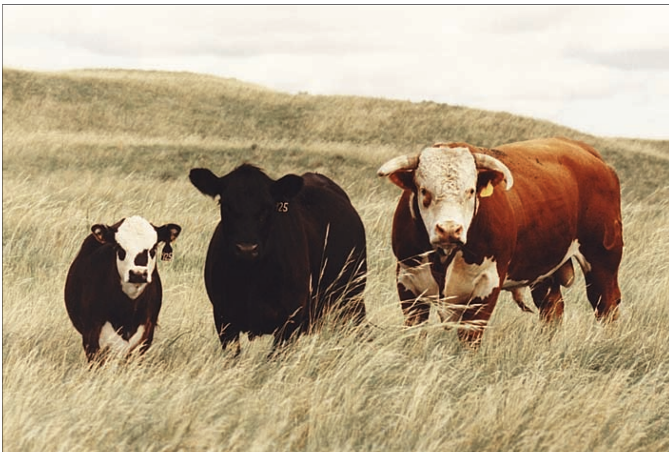
Commercial cow-calf producers using Hereford bulls on an Angus-based cow herd will produce baldie females with superior fertility, longevity and efficiency while maintaining moderate mature size and lower feed costs.

This research confirms the widely held opinion that Hereford × Angus is one of the top crosses for commercial beef production in many climates, particularly in terms of cow efficiency. Crossing with Continental breeds, which creates the corresponding increase in cow size and feed costs, is not needed in order to gain maximum heterosis. Commercial cow-calf producers using Hereford bulls on an Angus-based cow herd will produce baldie females with superior fertility, longevity and efficiency while maintaining moderate mature size and lower feed costs. HW