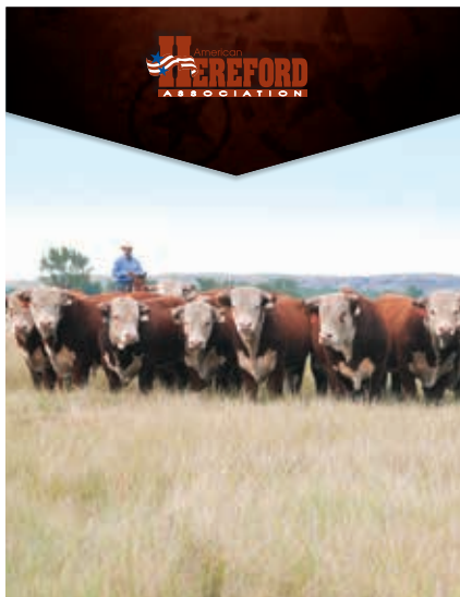
New member packet

A new member packet was presented as well as a strategy to follow up with new members via email to discuss opportunities and services provided by AHA. A new format has been designed through ShopHereford.com for breeders to customize promotional items for their sales.