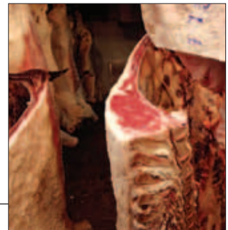
AHA NRSP Quality Grade 1999-2011

I also want to congratulate you for the strides you have made in