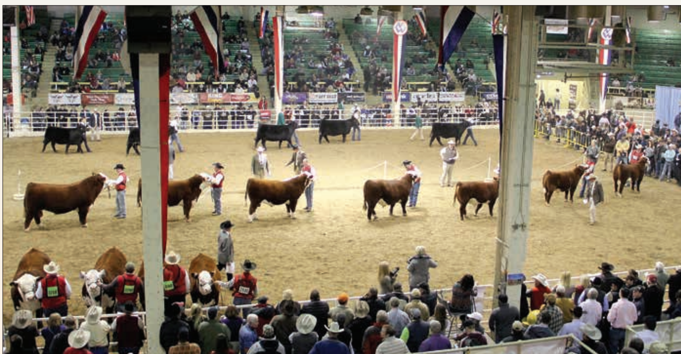
Pictured is the polled bull grand drive.