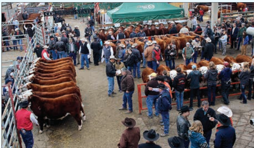
A highlight of this year's NWSS Hereford events was the pen and carload show as 278 head competed, up 94 head from 2014.