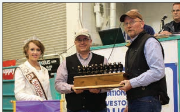
Delaney Herefords, Lake Benton, Minn., were presented a bronze trophy after their carload of junior bull calves were named champion carload.