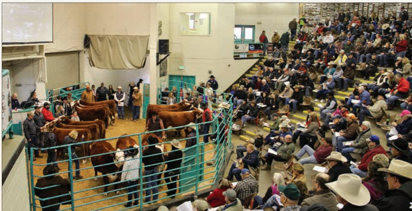
A large crowd gathered to witness the selection of the champion pen of three females.