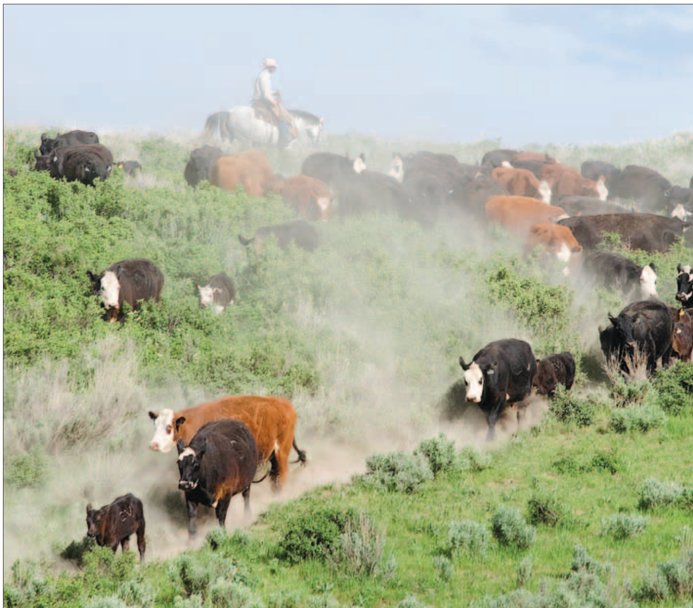
The rough mountain terrain is where Hereford bulls' soundness and longevity can make a difference, Tyler Knott says.

"The outcross of a Hereford bull is gaining us 30 to 40 lb. on weaning