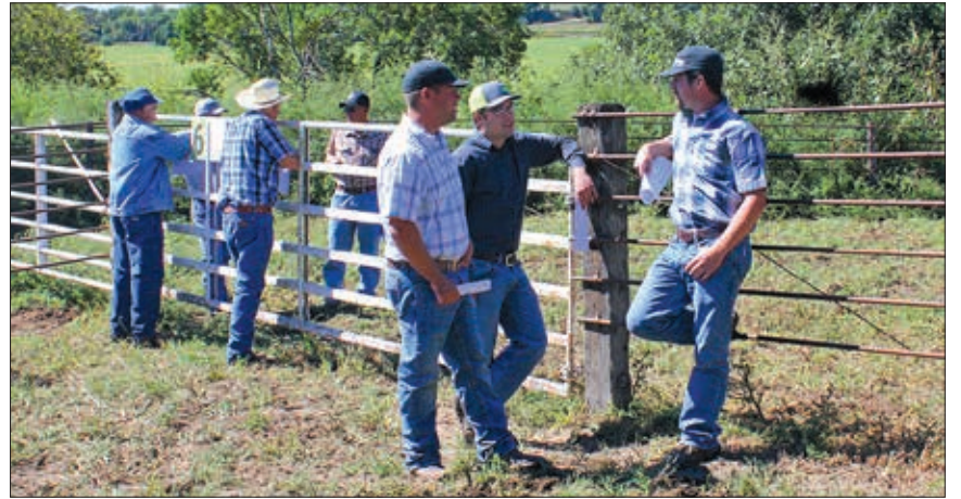
Participants enjoyed touring Hereford ranches in central Nebraska.

A judging contest was also hosted for tour participants.