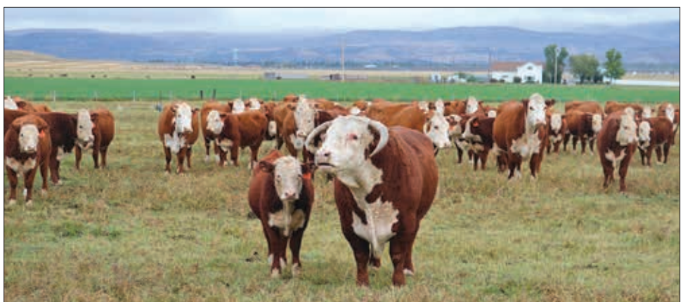
Cattle were on display at Feddes Herefords in Manhattan.

Day 2 included stops at Ehlke Herefords, Townsend, with a display from Anchor Polled Herefords, a stop at the historic Grant-Kohrs Ranch, and concluded with Thomas Herefords, Gold Creek, with displays from Bar Star, Lucky U Cattle Co., Garrison, Dutton Hereford Ranch and Rafter & Tomlinson. HW