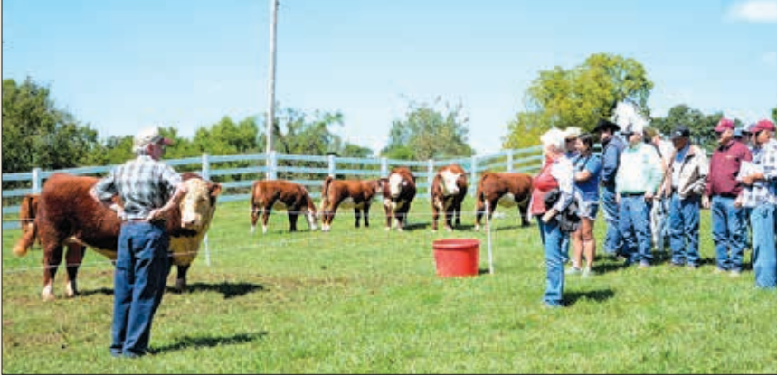
More than 70 Hereford breeders and enthusiasts attended the Missouri Hereford Field Day.

Juniors attending enjoyed a fitting and clipping demonstration and a skill-a-thon.