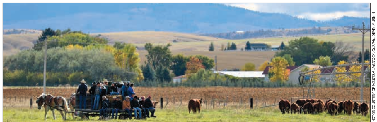
Participants took a pasture tour on a horse-drawn wagon.