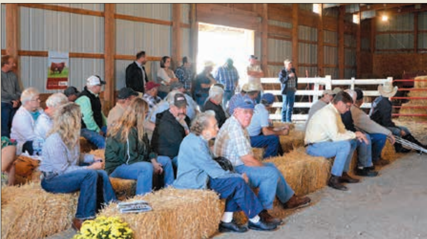
Participants heard from numerous breeders and industry leaders.