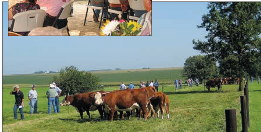
Hereford breeders visited farms in central Illinois during the Illinois Hereford Tour.