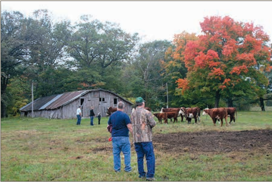
The first stop of the tour was Red Oak Farms, Detroit Lakes, where cow-calf pairs were on display.