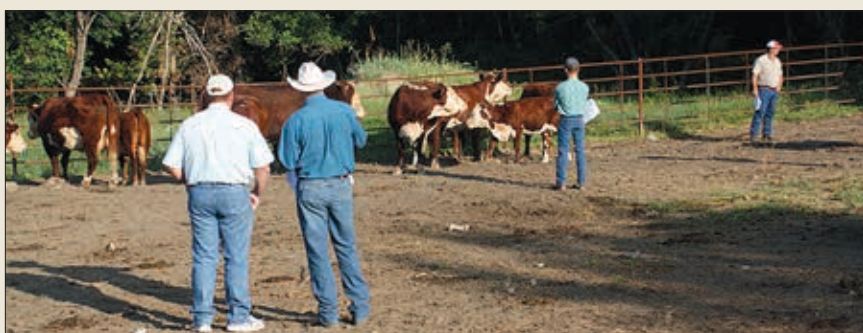
Cattle on display at Malone Polled Hereford Farm, Emporia.