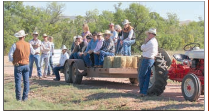
A good crowd attended the tour.