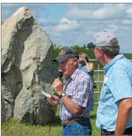
The tour made a stop at the birthplace of Polled Herefords near St. Marys and New Virginia. The parcel of land is the spot where the Gammon Barn originally stood before being moved to the Iowa State Fairgrounds.

Tour stops included Black's Herefords, Chariton, along with Offenburger Polled Herefords, Lacona, which brought a sampling of its herd to this location; Ohnemus Farms, Inc., Milo; Amos Hereford Farm, Indianola; and BAJA Cattle, Truro. A highlight of the tour was a stop at the birthplace of Polled Herefords near St. Marys and New Virginia.