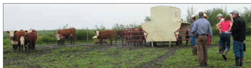
Participants walked through a pen to view the herd at Black's Herefords in Chariton.