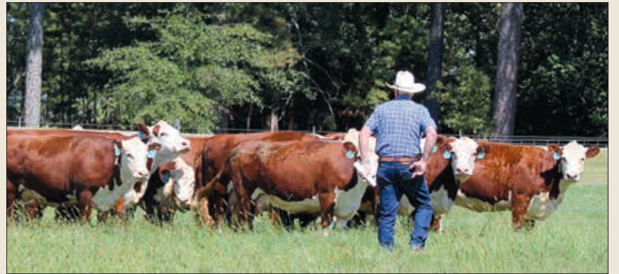
South Carolina Hereford breeders viewed the Clemson University Hereford herd.