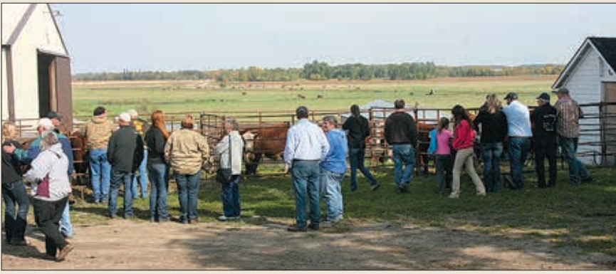
A nice crowd attended the Minnesota Hereford Tour.