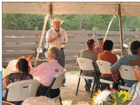
Numerous Illinois Hereford breeders welcomed attendees to their operations.

Hosting tours on Saturday were Stephens Hereford Farm, Taylorville; Sturdy Hereford Outlet, Rochester; Ostermeier & Meteer Cattle, Athens; and Prairie Rose Cattle, Sherman. West Wind Herefords, Edinburg; Bafford Farms, Blue Mound; and Loehr Hereford Farm, Peoria, welcomed attendees on Sunday.