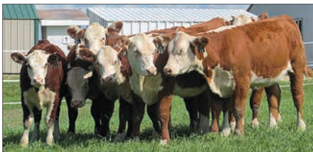
BAJA Cattle, Truro, displayed heifers during the tour.