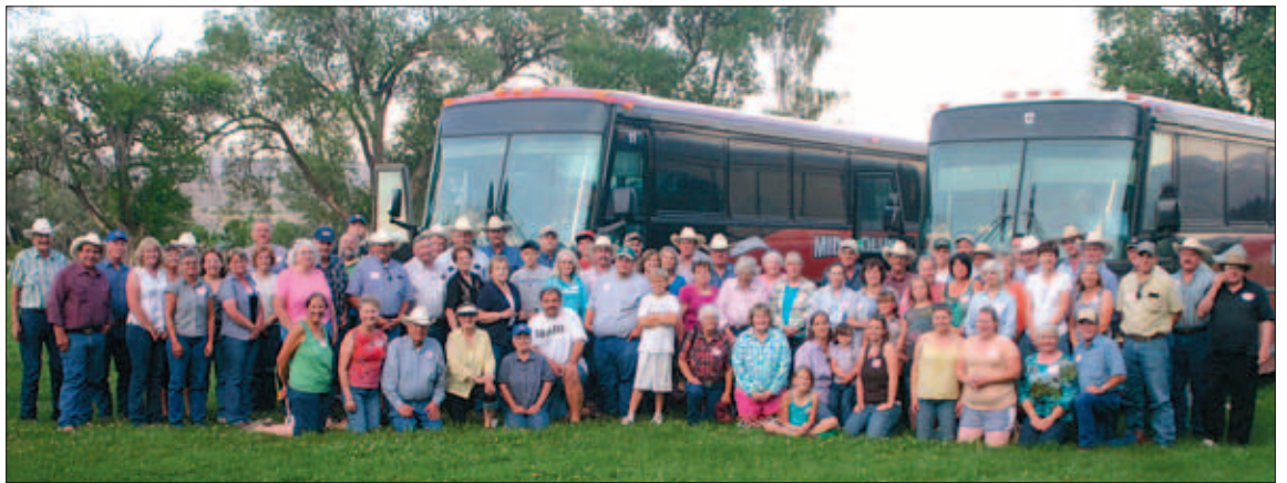
Baker County Hereford Tour attendees pose for a group picture at Richland City Park.

Attendees toured five commercial operations and four registered operations, as well as experiencing the Wild Sheep Jet Boat Tour through Hells Canyon. Stops included Forsea & Sons, Richland; Hutton Herefords, Halfway; Bird Herefords, Halfway; Willmarth Herefords, Halfway; Chandler Herefords, Baker City; Colwell Ranches, North Powder; Maxwell Ranches, Clifford; Tom Hill Ranch, Haines; and Harrell Hereford Ranch, Baker City.