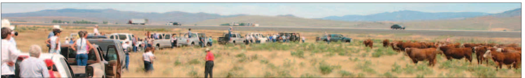
Bulls on display at Colwell Ranches.