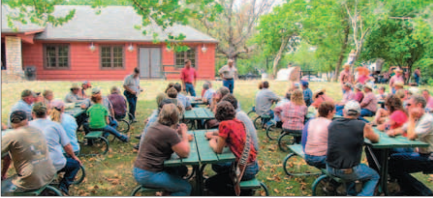
Lacey State Park near Keosauqua provided a picturesque setting for a steak lunch and the IHBA's annual meeting.