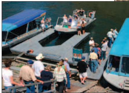
Attendees had a chance to experience a jet boat tour through Hells Canyon.