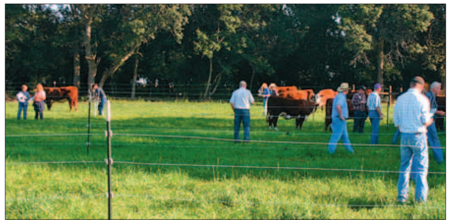
Tour participants enjoyed looking at cattle at the Springwater Polled Herefords and K&M Cattle Co. tour stop outside of Pipestone.