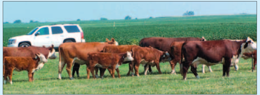
Cattle on display at Cole Farms near Roberts.