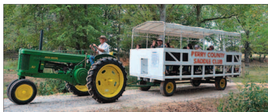
A restored antique tractor pulled visitors around to view cattle.