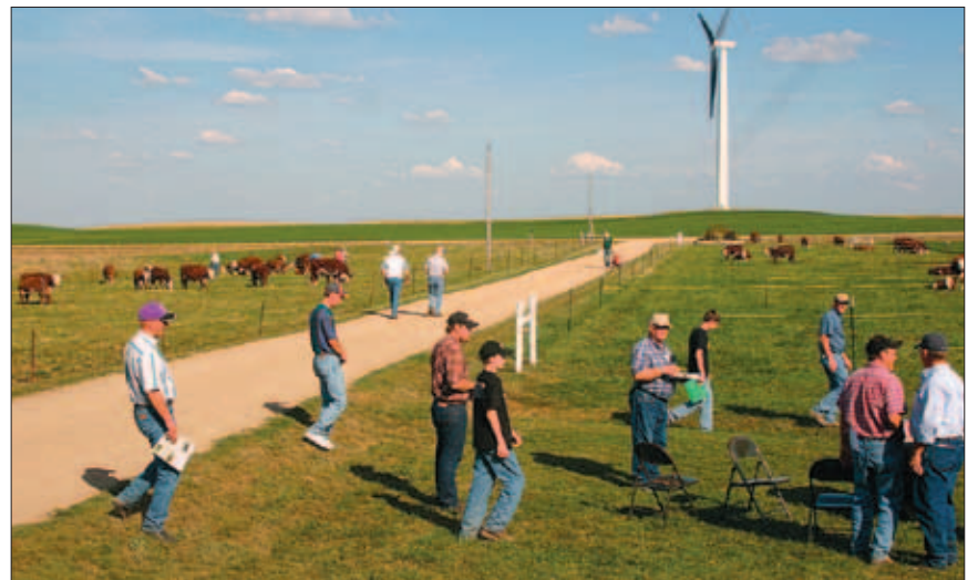
Delaney Herefords was the last stop of the day. During the stop, Delaneys hosted a bid-off sale and provided everyone a great supper.