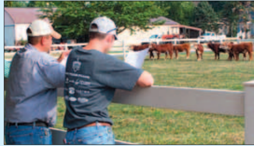
Tour attendees enjoyed the stop at Kline Herefords.