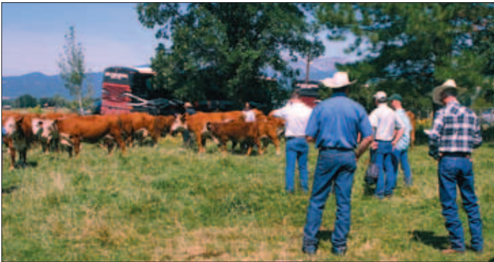
Cattle on display at Bird Herefords.