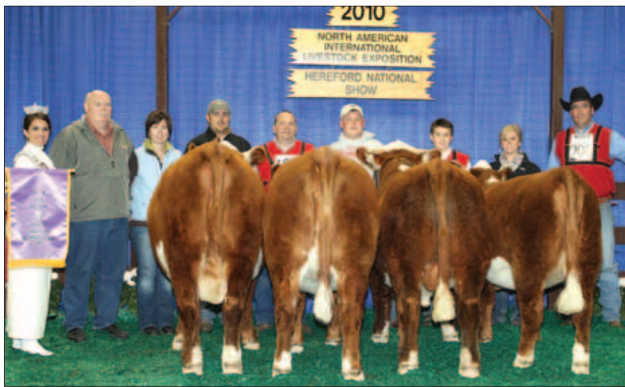
Get-of-Sire — CH Enuff Profit 2913 progeny, by DeLHawk Herefords, Earlville, Ill.

Reserve yearling champion bull: Oak Ledge Farm, Belmont, N.H., with KEB Erec E Deal 609W by H Easy Deal 609 ET.