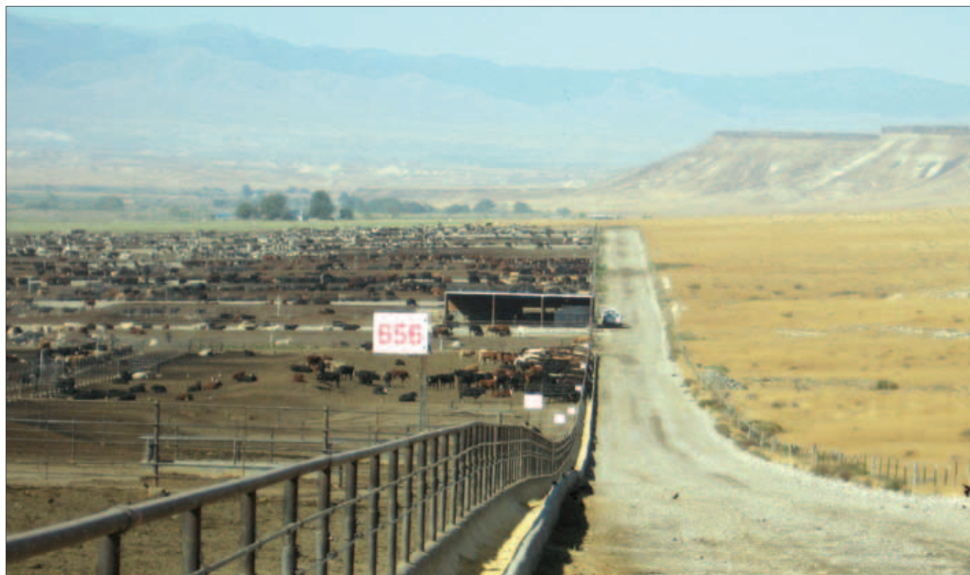
Simplot has discovered Hereford genetics provide consistency in the feedlot, resulting in added value and marketability for their feeder cattle.

Yes, for the J.R. Simplot Co., consistent value has been found in the Hereford breed. HW