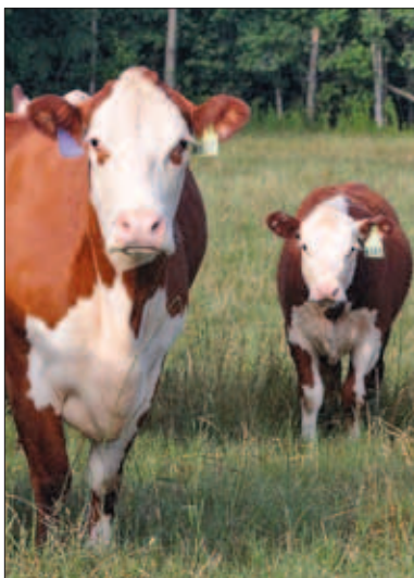
Half of the Greenview cow herd is bred to Hereford bulls while the other half is bred to red Brahman bulls to produce F1 Braford.