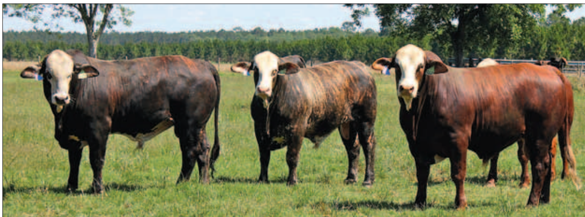
The F1 bulls are also in high demand. For several years Greenview Farms has been the second largest producer of Braford in the U.S. by number of animals registered.