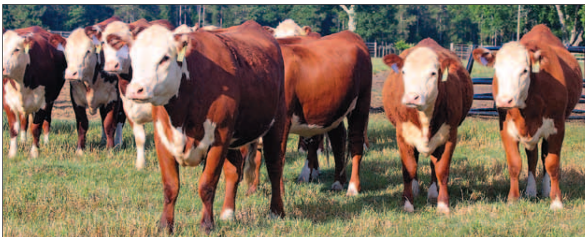
Replacement heifers are bred to calve in mid-December. After calving they are immediately turned with a bull. This practice has led to a 95% breed-back conception rate and helped move the females up in the calving cycle. To remain in the cow herd, a heifer must calve at 2 years old, perform on grass, have a good udder with good milk flow and produce a calf every year.