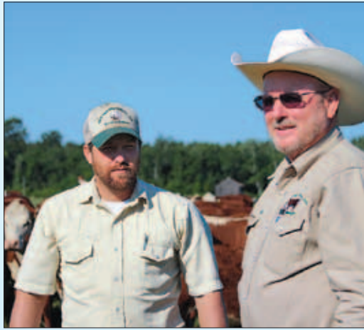
The father-and-son team work together to manage the cattle, farming and timber operation.