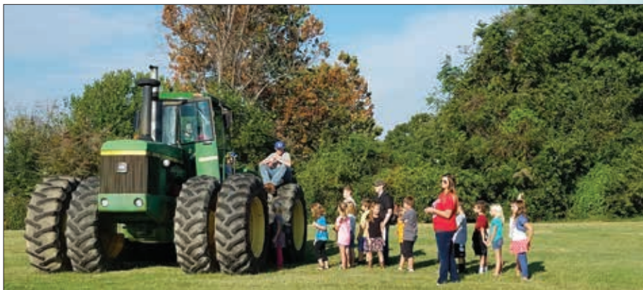
FFA members are helping to educate elementary and preschool students about livestock animals and their importance to agriculture and to them.