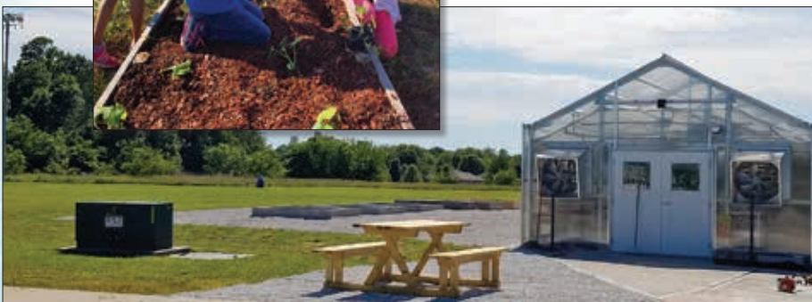
This year students have installed an additional four beds and have also been working on the landscaping, utilizing weed fabric covered with stone, around the community garden before it is fenced in. There is still room to expand on the garden in the future as well as to allow students to keep up with the eye appeal of the garden.